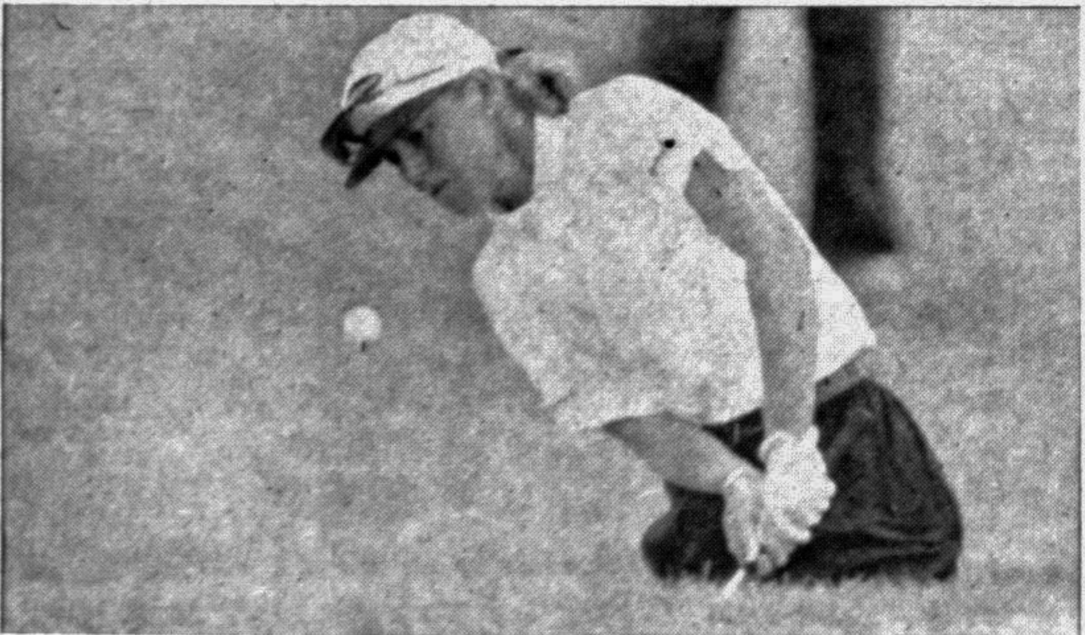
Helen Alfredsson of Sweden chips on to the 12th green during the first round of the US women's open golf championship at Indianwood Golf and Country Club on July 21.