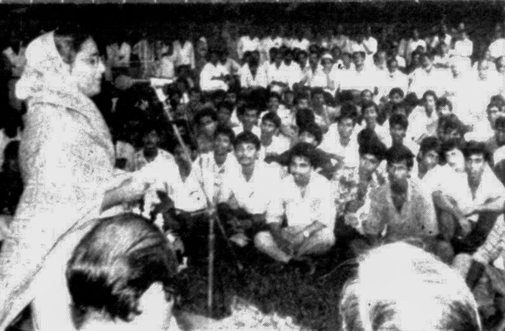
Leader of the Opposition Sheikh Hasina addressing a group of people at her Minto Road residence in the city yesterday who joined the Awami League.