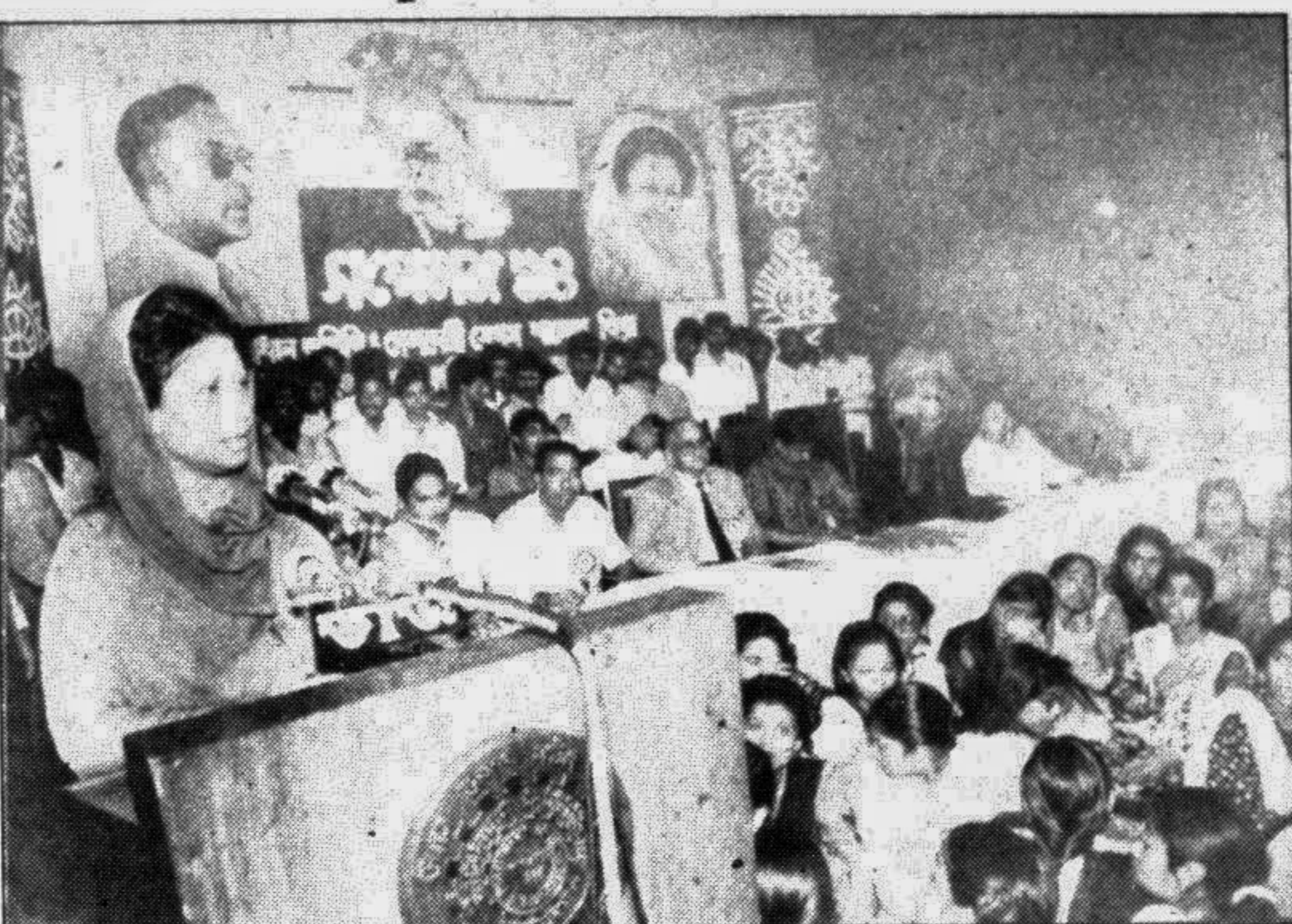
Prime Minister Begum Khaleda Zia addressing the Annual Conference of Dhaka City unit of the Jatiyatabadi Chhatra Dal at the auditorium of the Institution of Engineers in the city yesterday.

However, the unrestrained fun and festive mood associated with the bathing of the children in rain present a very refreshing spectacle. Their enjoyment finds a responsive chord in our hearts and gladdens us immensely. For the city people do secretly nurture a hope to bathe in really pure and abundant water like the naked children.