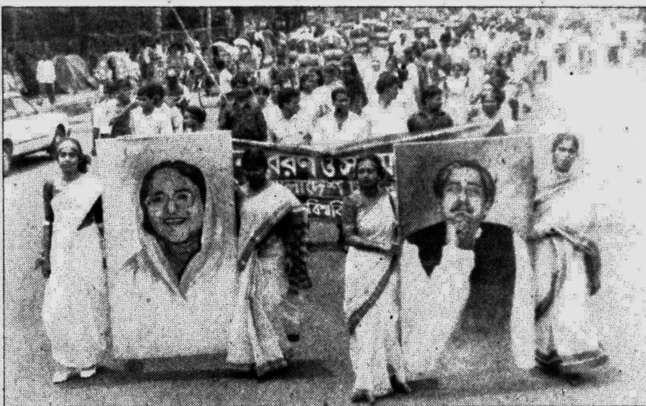
The Bangladesh Chhatra League (M-I) brought out a colourful rally on the Dhaka University campus yesterday on the occasion of the freshers' reception and its council.

The nuns at the Tejgaon home perform an excellent service for the poor, despite their self-effacing and shy ways. They have courage and endurance to work with the ill and destitute without finding any material reward. Had they not been there, hundreds would have perished in the streets.