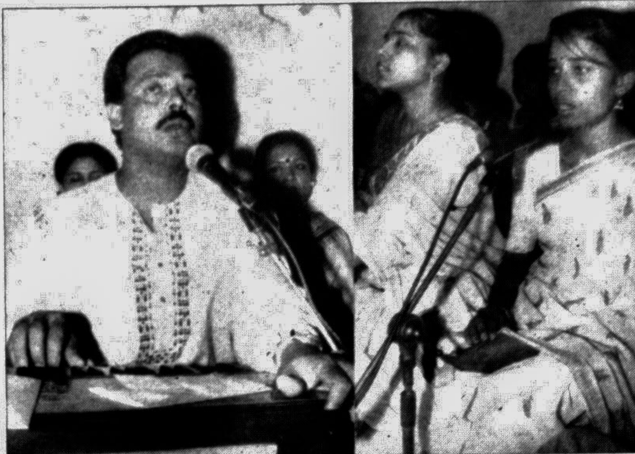
Artistes of Chhayanot paid homage to late Jahanara Imam by presenting her favourite Tagore songs at the WVA auditorium in the city yesterday.

The envoy and the minister exchanged views on the light of the Shariah laws of Islamic religious institutions functioning in both the countries.