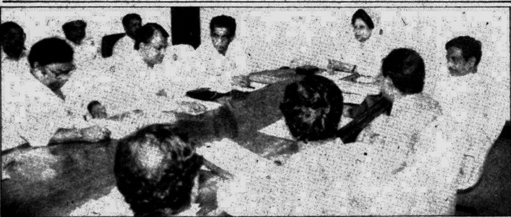
Leaders of the Bangladesh Textile Mills Federation called on Prime Minister Begum Khaleda Zia at her office yesterday.