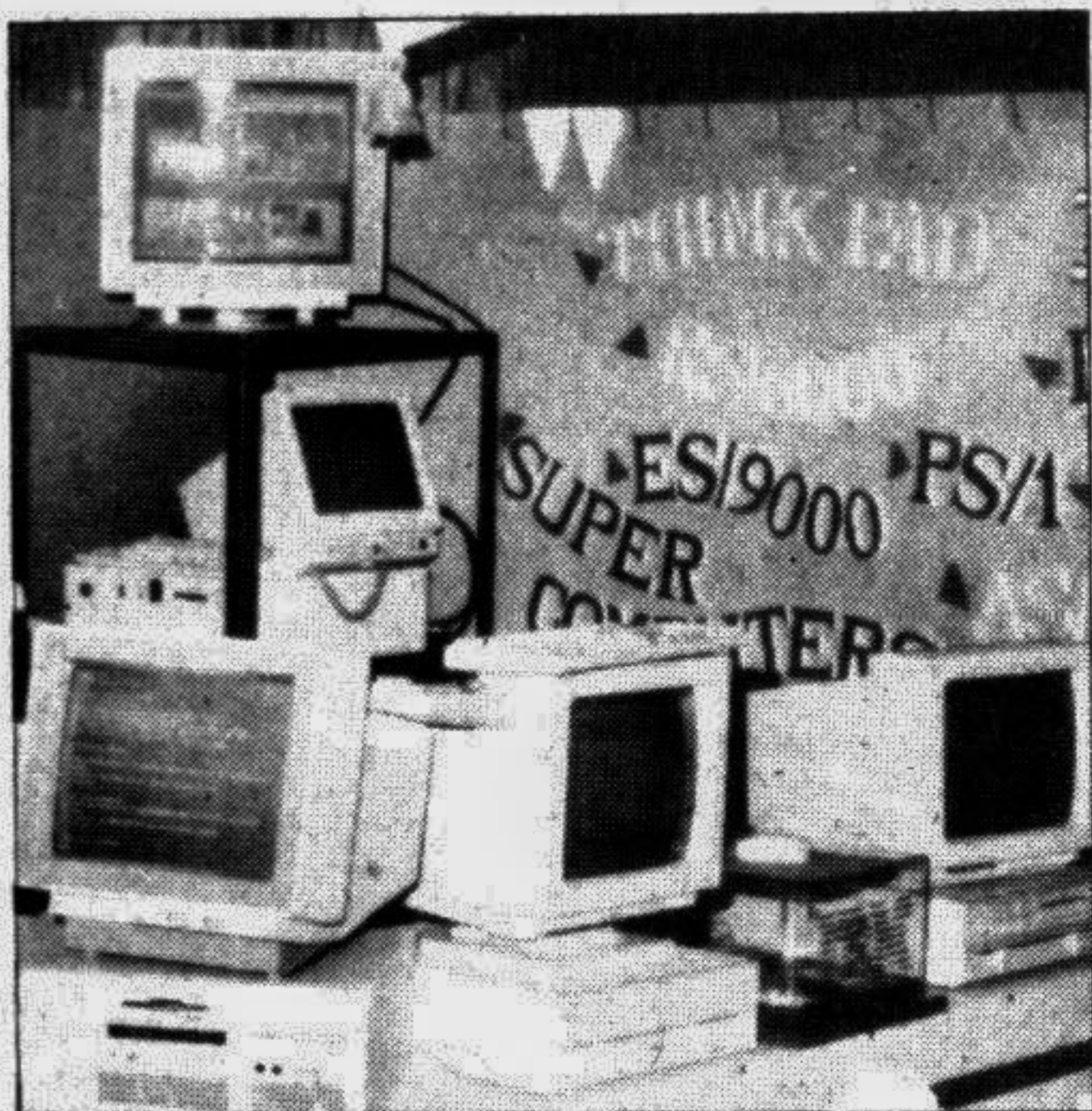
The wonder of machine

Machines are heartless. A coffee machine in Bangladesh talks, laughs and has a name. And so does the washing machine and the door-opener. But these jobs can exist only at the grace of low wages.