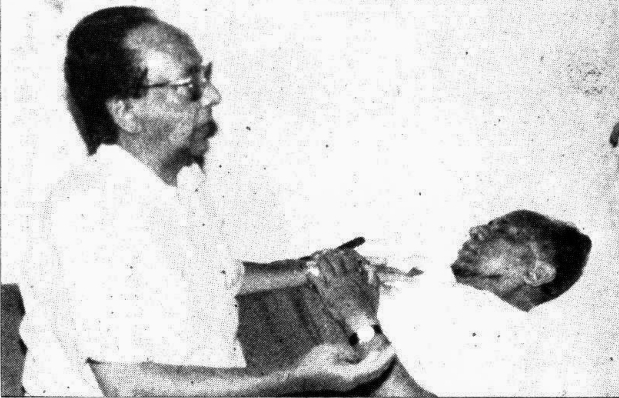
Awami League general secretary Zillur Rahman visited ailing Abus Samad Azad, Deputy Leader of the Opposition in Parliament, at the Suhrawardi Hospital in the city yesterday.