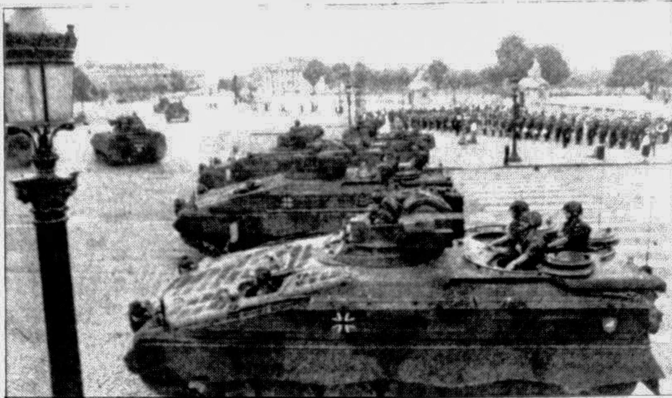
German 'Marder' combat vehicles taking part in the traditional Bastille Day parade yesterday pass through the Place de la Concorde in Paris.

The banks are already under constant pressure in managing their provision accounts for their bad debts. Provision accounts have to be maintained from the banks' profits which would decrease