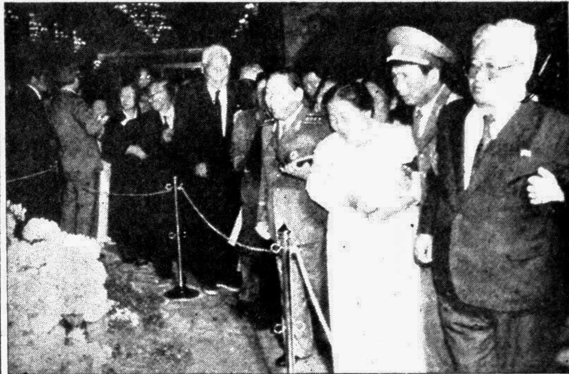
War veterans pay their last respects July 12 to North Korean President Kim Il-Sung whose body is lying in state at the Presidential Palace in Pyongyang.