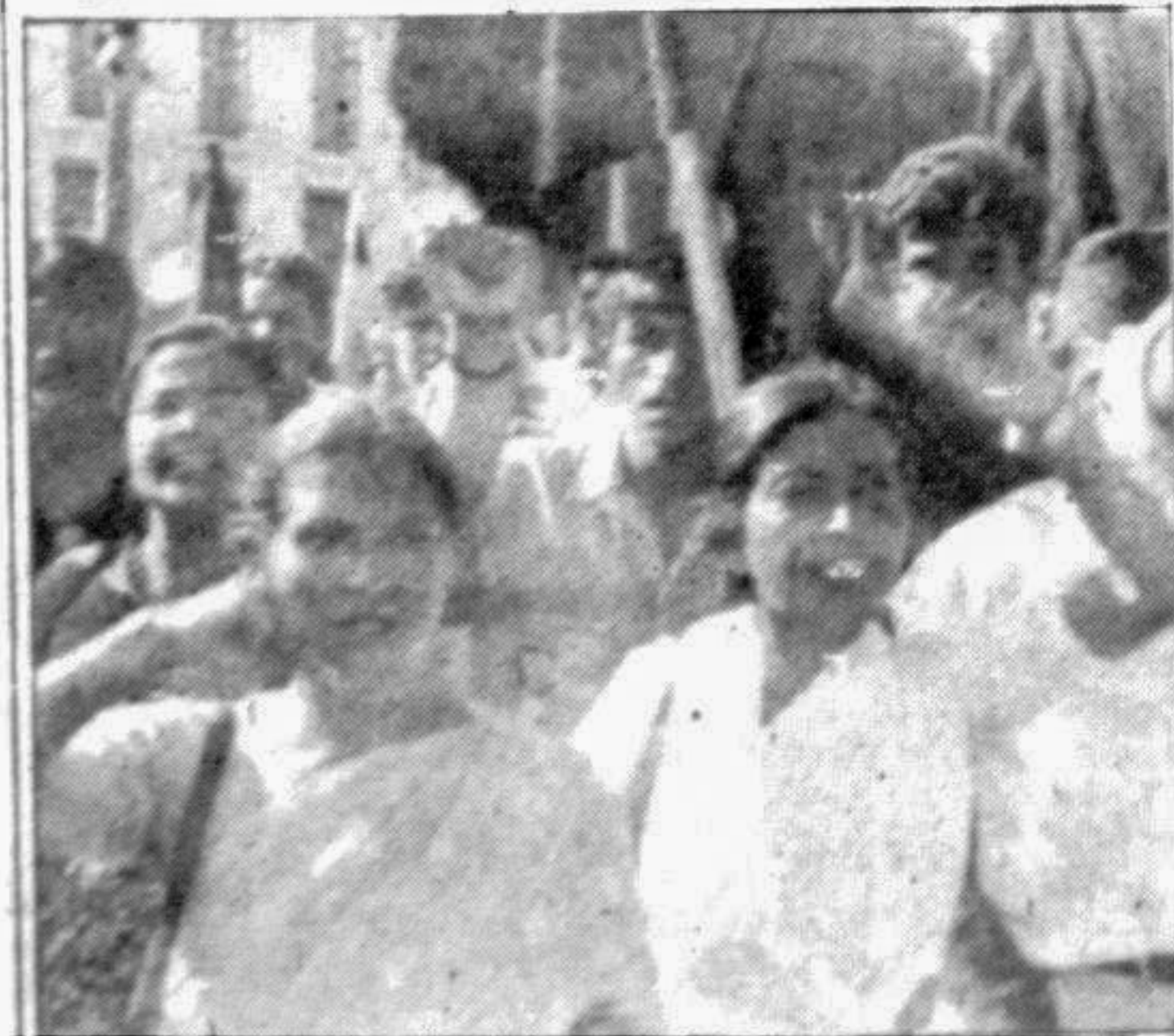
Pro-leftist youths, students and activists of the Nepal Communist Party shout slogan against King Birendra and Prime Minister Girija Prasad Koirala on Tuesday during a demonstration in Kathmandu.

KATHMANDU, July 13: More than 25,000 communists from different factions took to the streets today to denounce the Nepalese King and Prime Minister for dissolving parliament and calling mid-term polls, witnesses said, reports AFP.