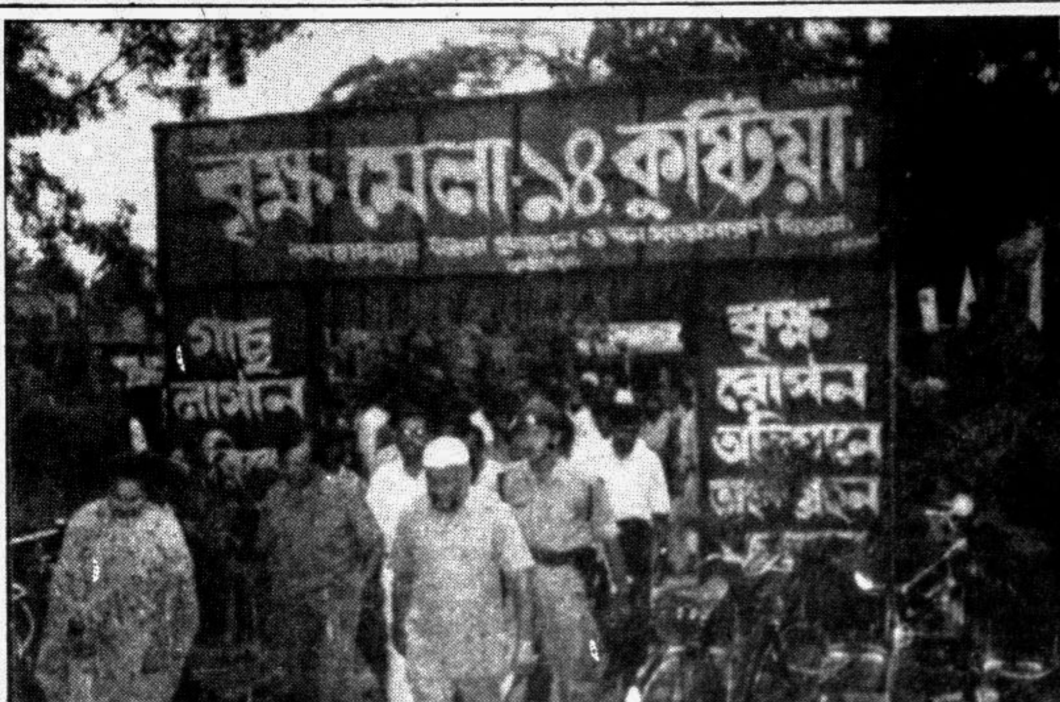
KUSHTIA: A 10-day long tree sapling nursery fair began here at the Kushtia Collectorate premises recently. Various types of saplings are being sold at the fair at subsidised prices.

Some blacksmiths said if financial supports were available, they could make high quality agricultural implements and household tools at comparatively low prices.