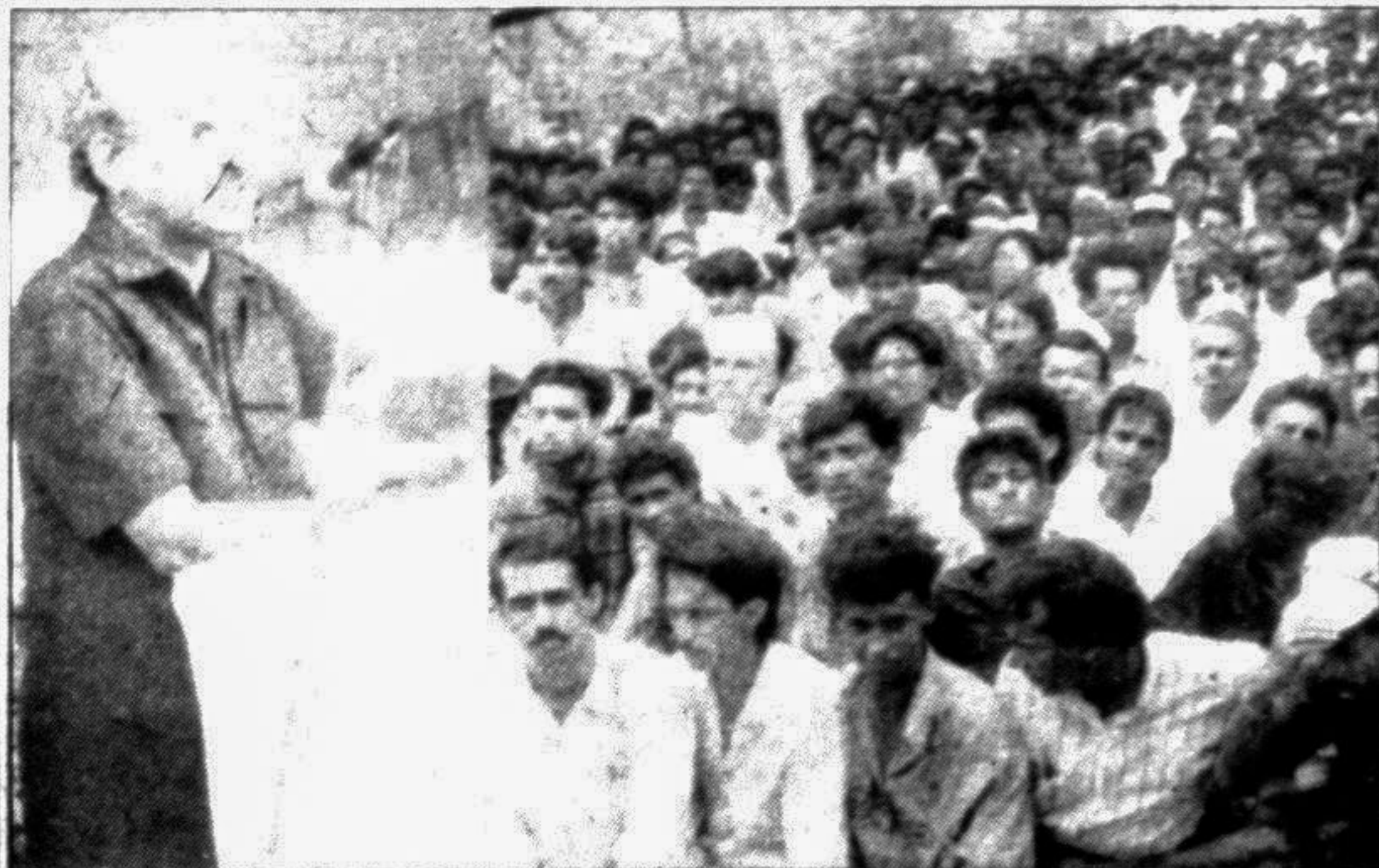
SYLHET—Finance Minister M Saifur Rahman speaking at a public meeting at Ilashpur recently. He inaugurated a bridge on Sylhet-Fenchuganj highway built at cost of Taka 90 lakh.

The government has sanctioned 3267 metric tons of wheat for the implementation of the projects, the source added.