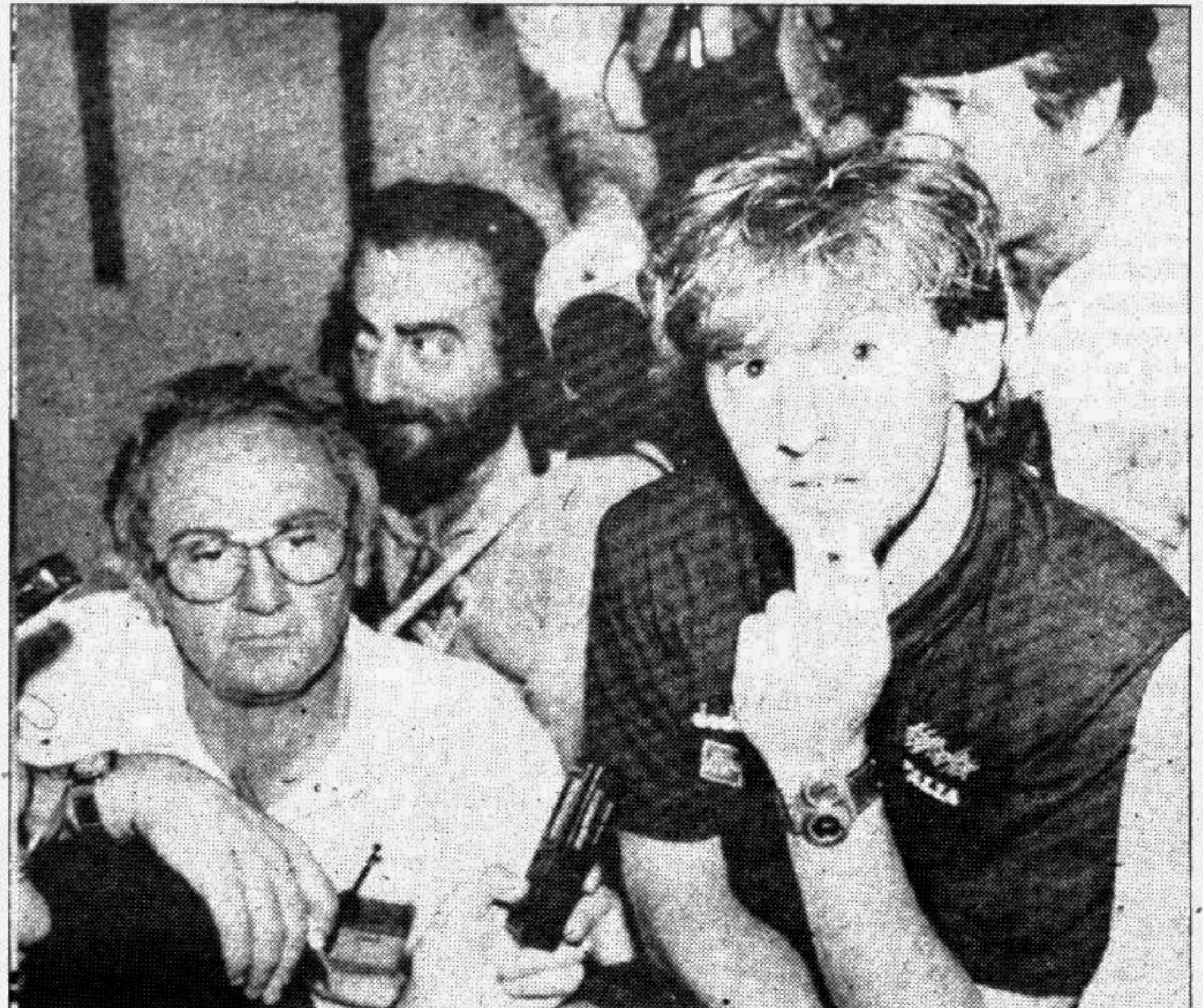
Italian striker Giuseppe Signori talks to reporters at Bernards Township's Pingry School on July 11. Italy take on Bulgaria in the World Cup semifinals on July 13.