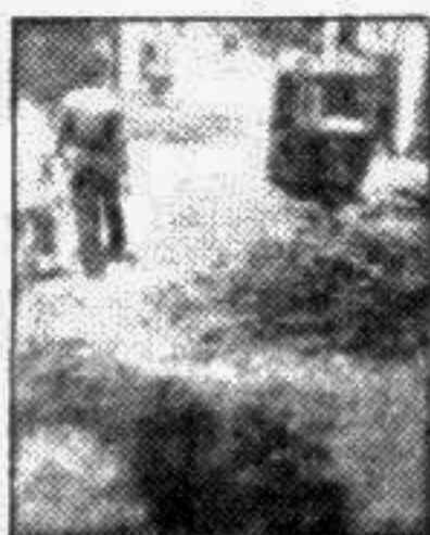
More than Holes Page 3