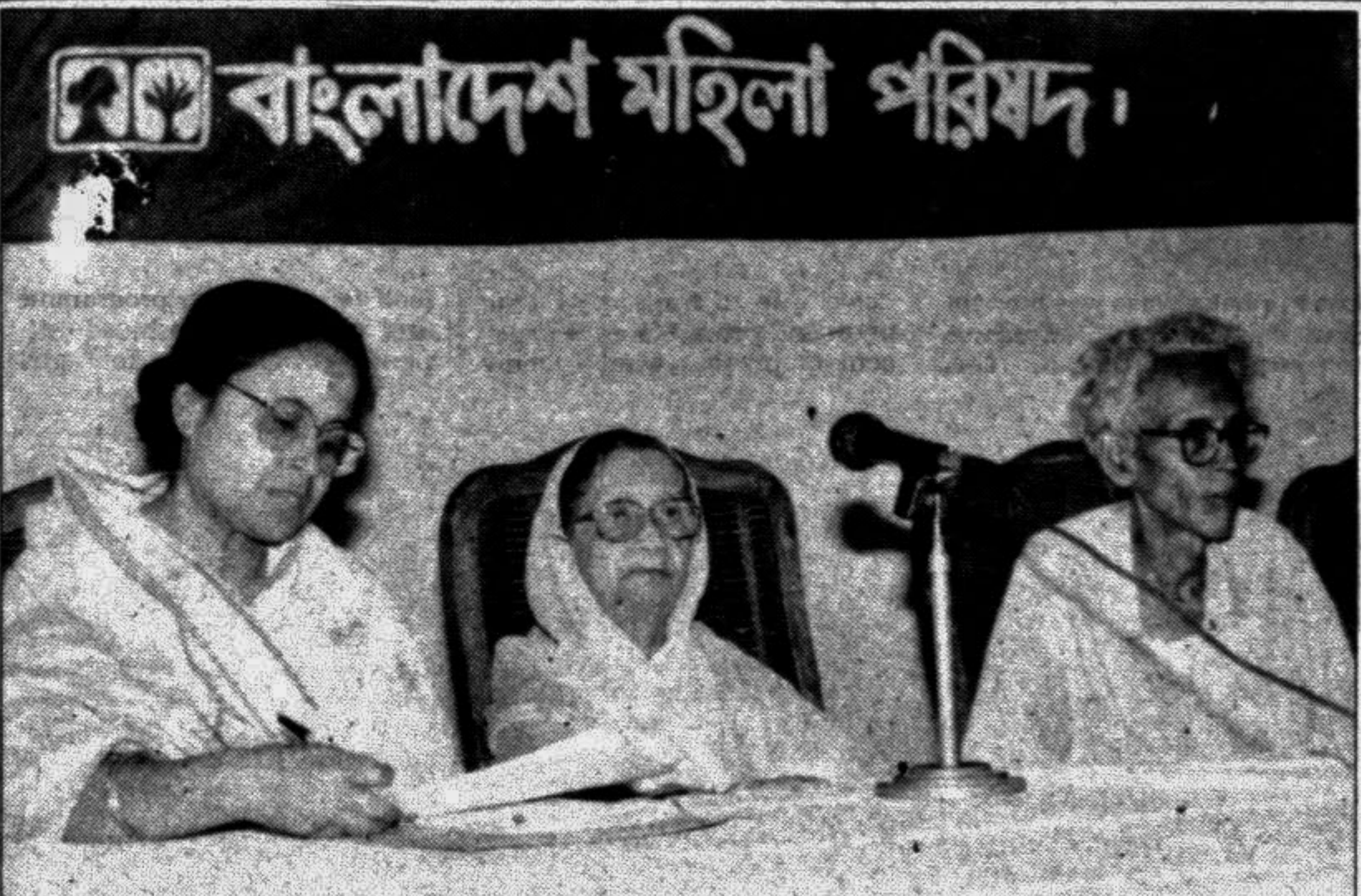
Begum Sufia Kamal speaking at a condolence meeting in memory of Jahanara Imam organised by the Bangladesh Mahila Parishad at the National Press Club in the city yesterday.

All friends and admirers are requested to pray for his departed soul.