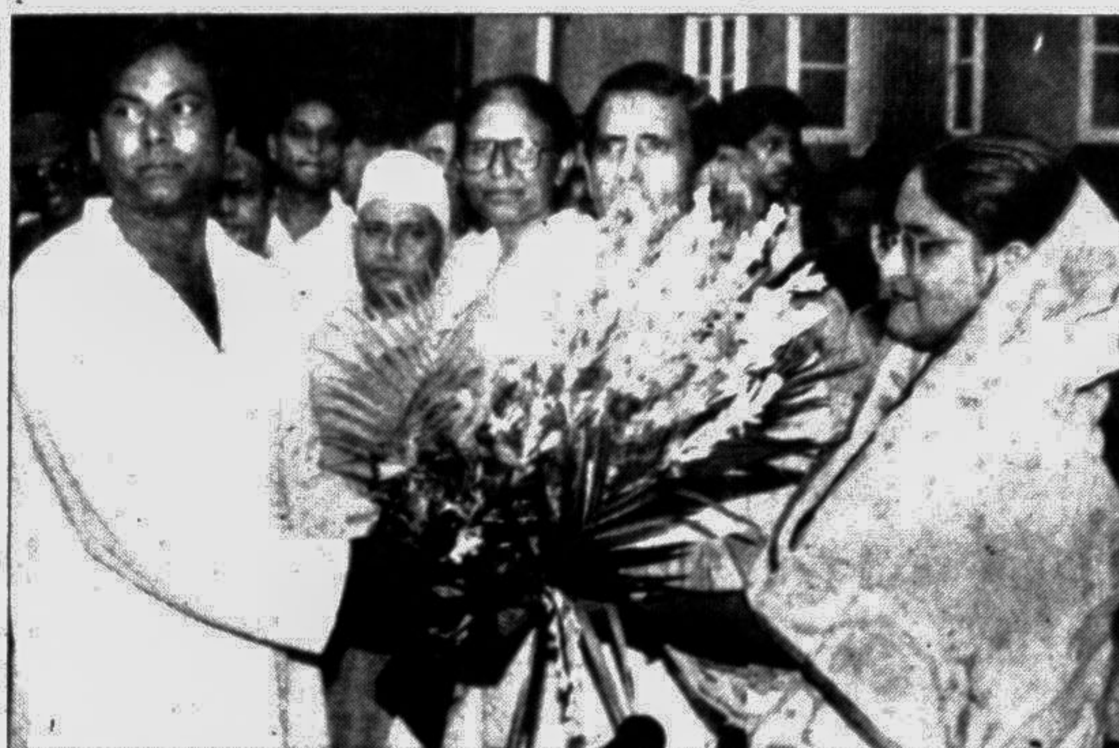
Leader of the Opposition Sheikh Hasina receiving a bouquet from a representative of the 200 activists of Jatiya Party, Cantonment thana, who joined the Awami League in the city yesterday.