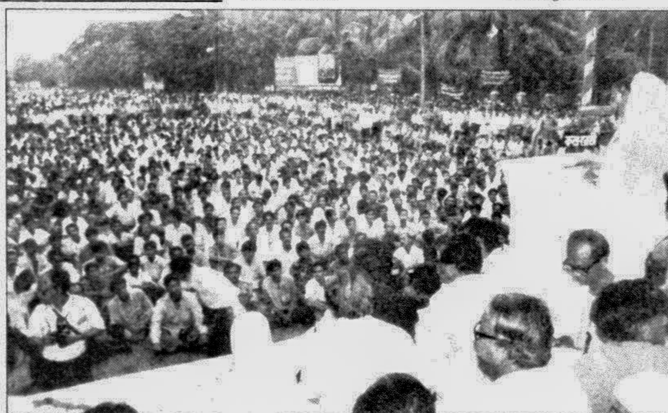
The Nirmul Samannaya Committee organised a meeting to condole the death of Jahanara Imam at the Suhrawardi Uddyan in the city yesterday. Awami League chief Sheikh Hasina also addressed the gathering.