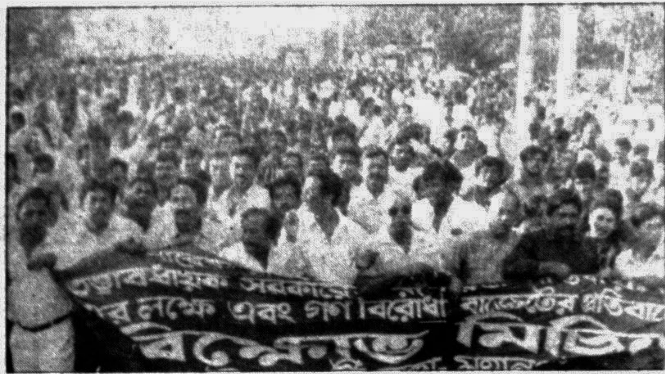
The Jatiya Party brought out a procession in the city yesterday demanding elections under a caretaker administration.