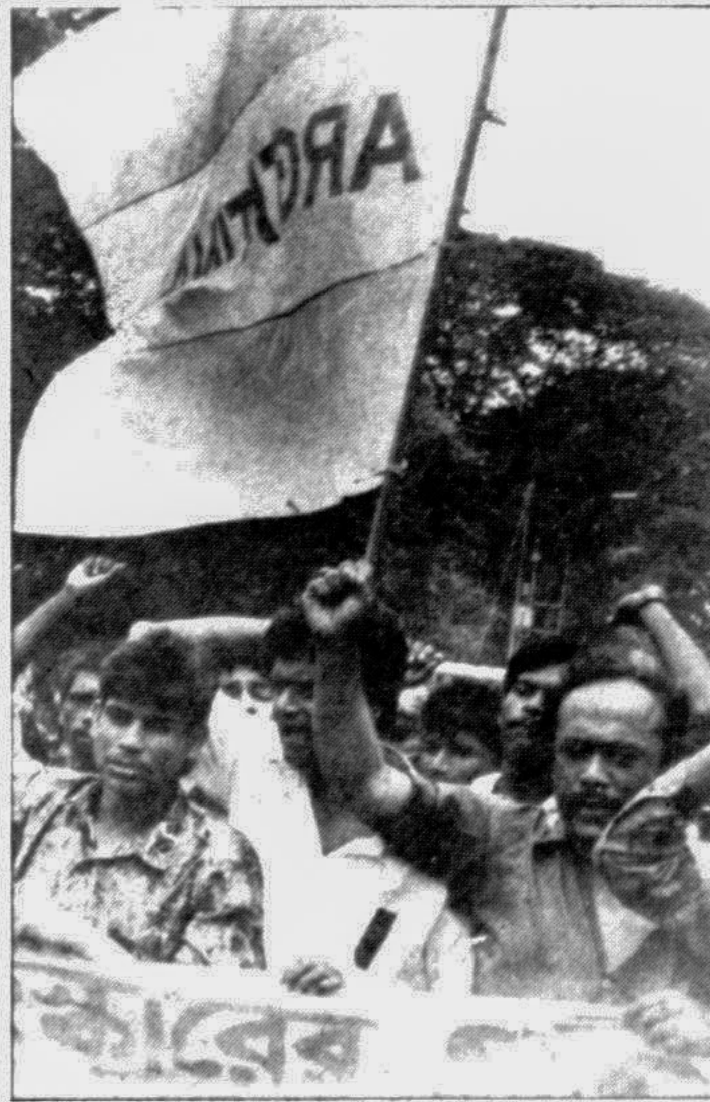
A procession in the city yesterday protesting the expulsion of Argentine captain Maradona from the World Cup for drug taking.

Seth selected for C'wealth Writers' Prize The judges for the Commonwealth Writers' Prize for the Eurasia region have met in Dhaka between June 28 and 30 to consider 30 entries of books by authors from India, Pakistan and UK, says a press release.