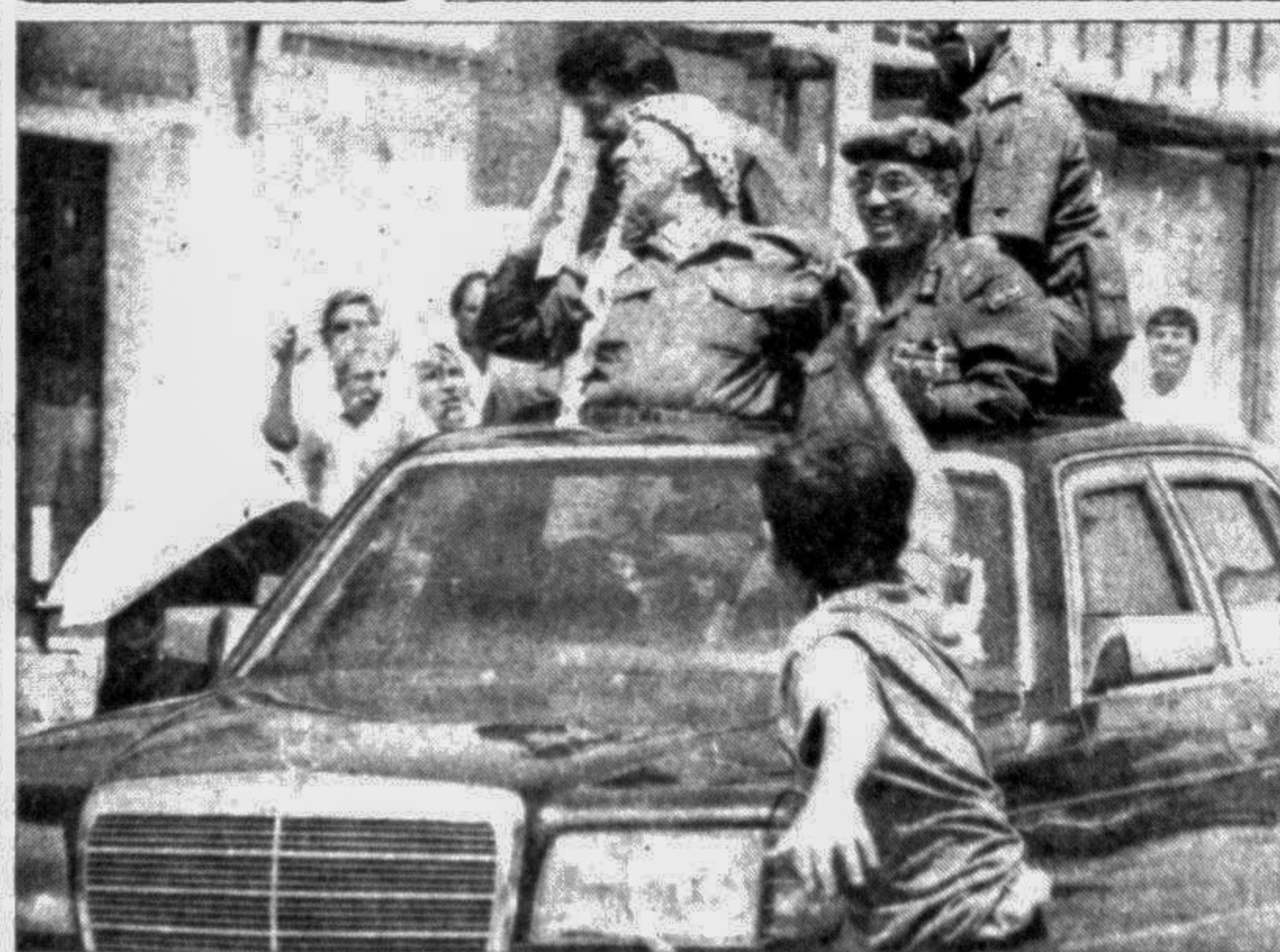
A Palestinian boy runs waving to PLO chairman Yasser Arafat blowing kisses while touring Gaza city yesterday.