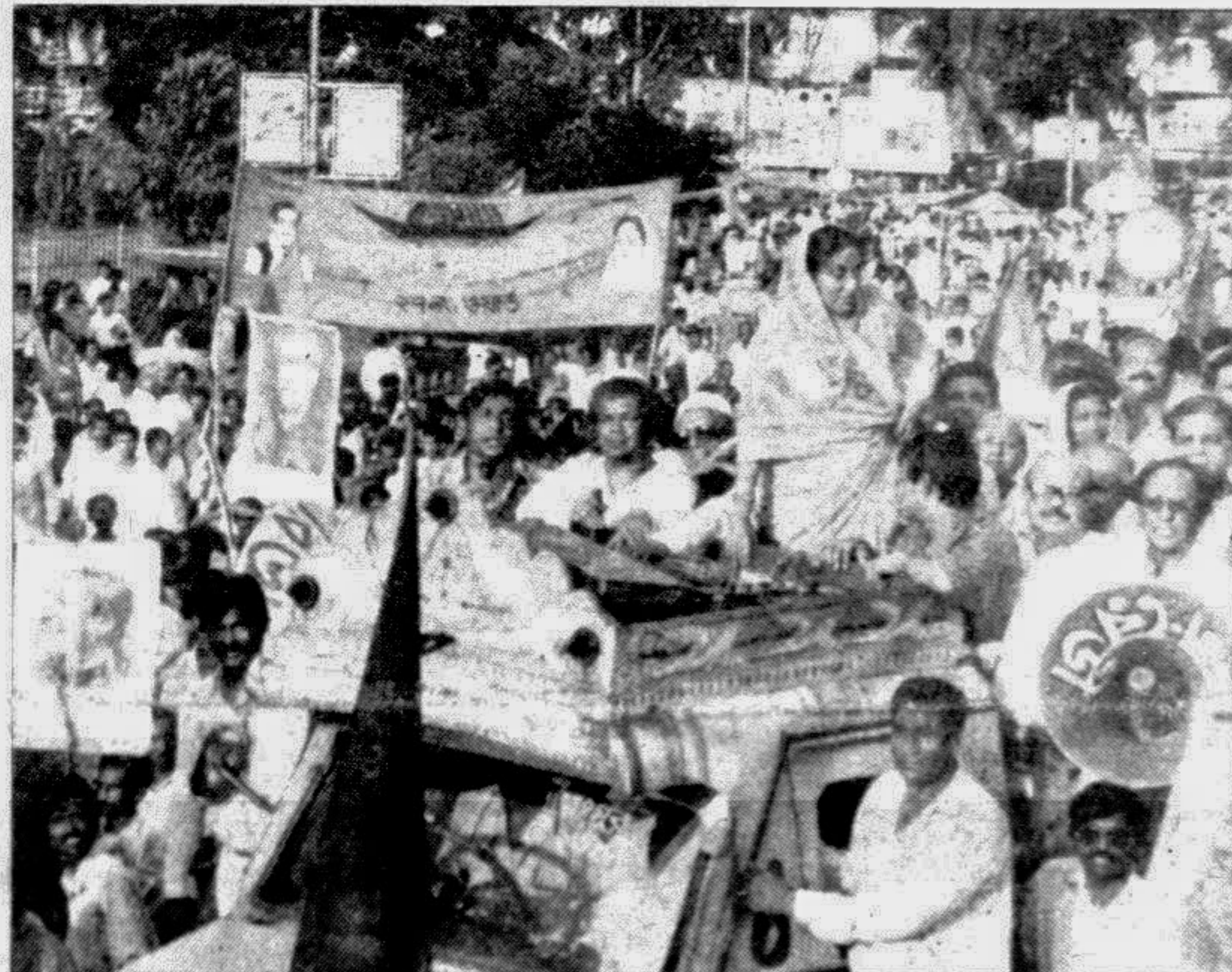
The Awami League brought out a procession in the city yesterday on the first day of its agitation programme for a caretaker government.