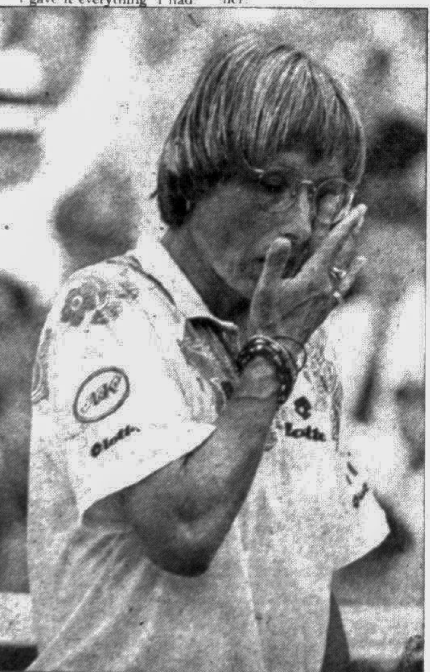
American Martina Navratilova wipes away a tear after losing to Spaniard Conchita Martinez in her record 12th Wimbledon singles final in London yesterday. Martinez won 6-4, 3-6, 6-3.

"All right. We'll definitely have tea," the Duchess told her.