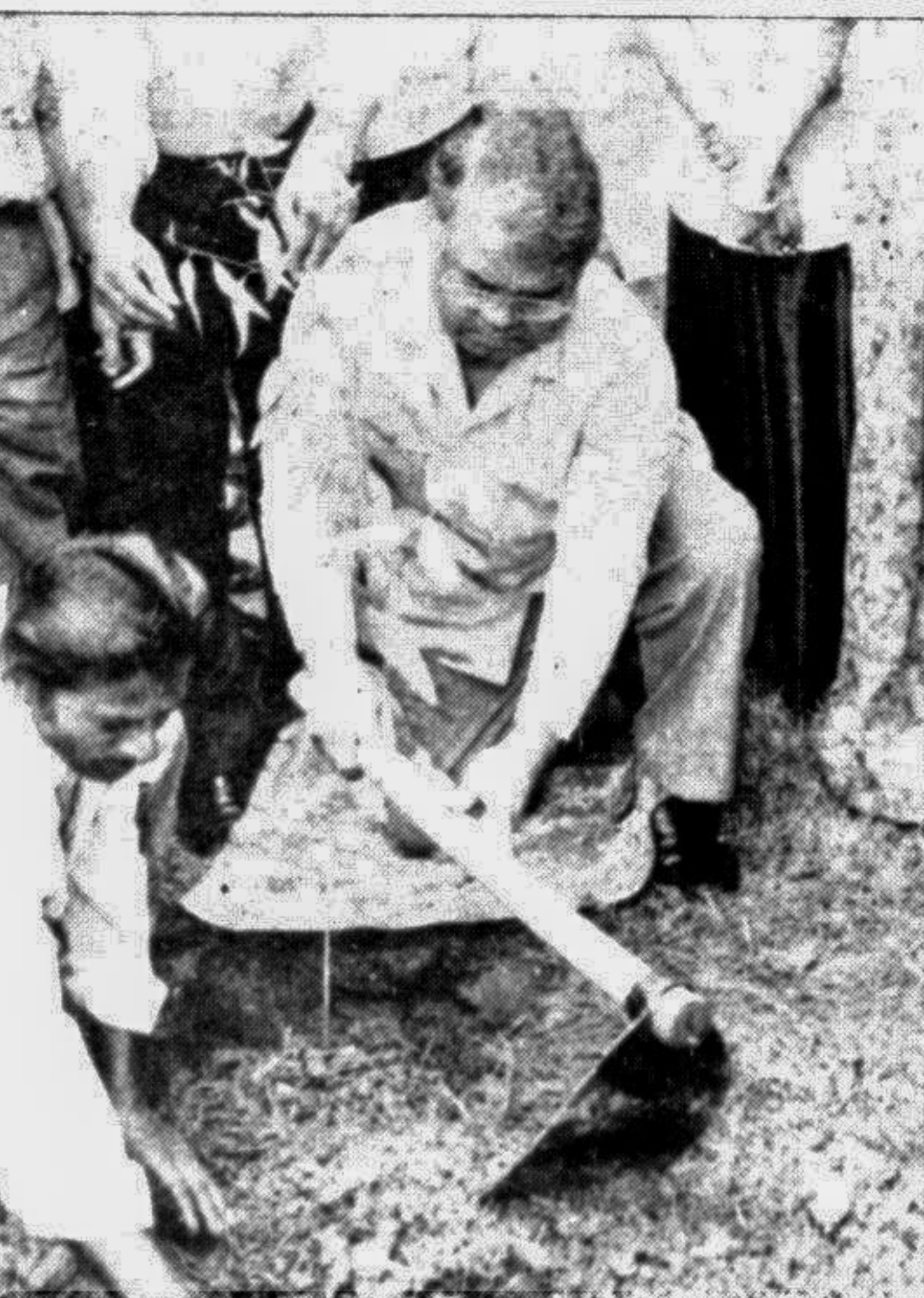
Information Minister Barrister Nazmul Huda inaugurated the Tree Plantation Campaign of Bangladesh Film Development Corporation (FDC) by planting a sapling at the FDC premises in the city yesterday.

Of the arrested, 12 were wanted criminals, two were held under the Arms Law, two for stealing.