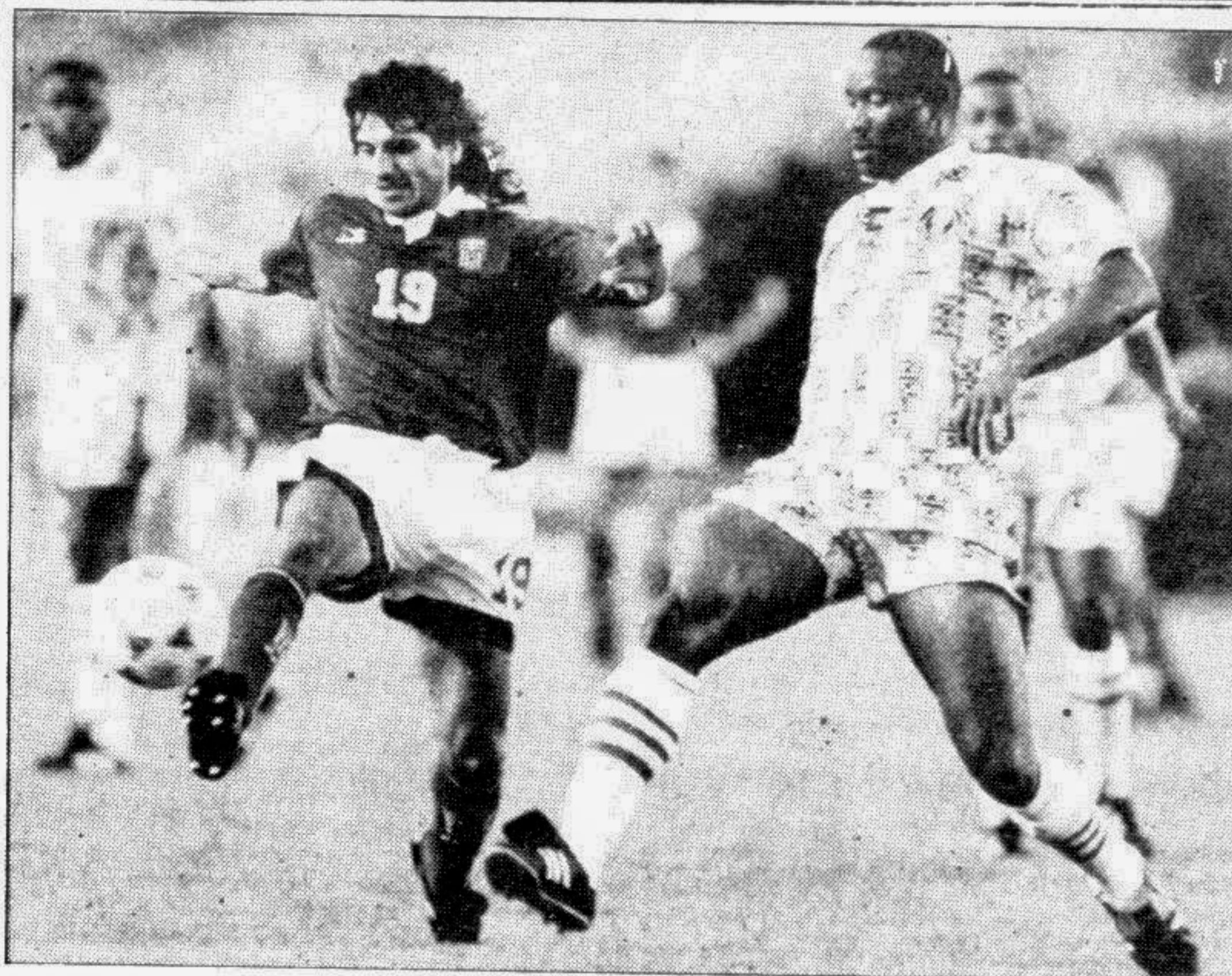
Greek Savvas Kofidis (L) takes the ball away from Nigerian defender Okechukwu Uche during their final Group D match at the Foxboro Stadium in Boston on Thursday.

Salim Malik (captain), Asif Mujtaba (vice captain), Rashid Latif (wicketkeeper), Javed Miandad, Aamir Sohail, Saad Anwar, Basit Ali, Inzamamul Haq, Zahid Fazal, Mushtaq Ahmed, Akram Raza, Waqar Younis, Wasim Akram, Ashfaq Ahmed, Kabir Khan and Rameez Raja.