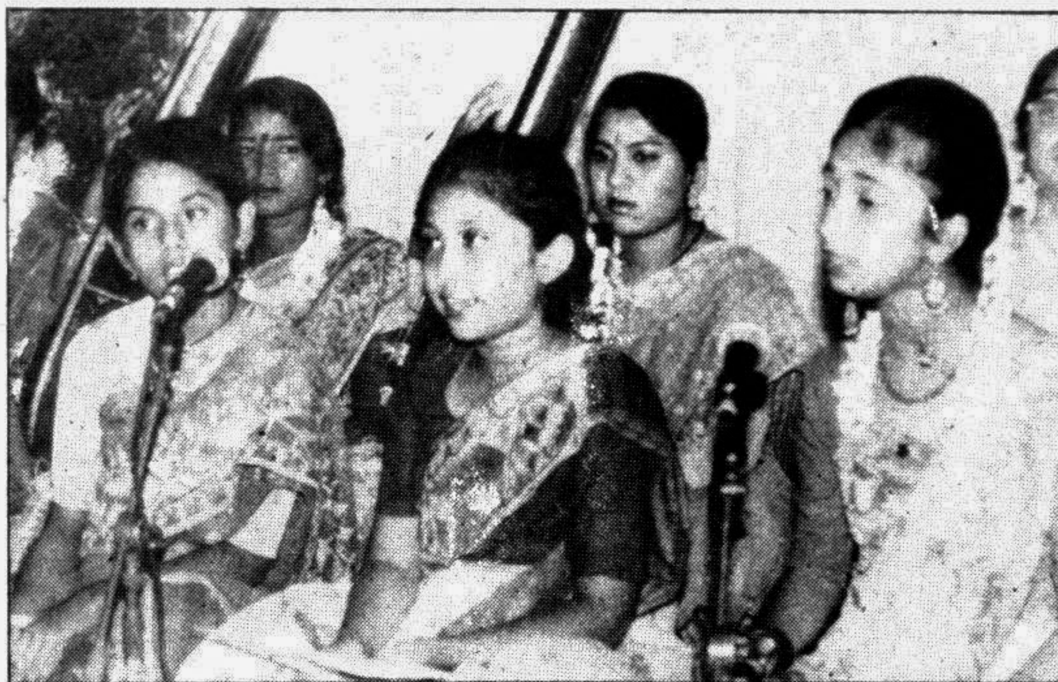
Members of the Surobani presenting songs at a function held at the Russian Cultural Centre in the city yesterday.

But even at times accountants or bank cashiers are helpless, because not many fresh notes are available in the market. So you just have to turn to the chera note exchanger.