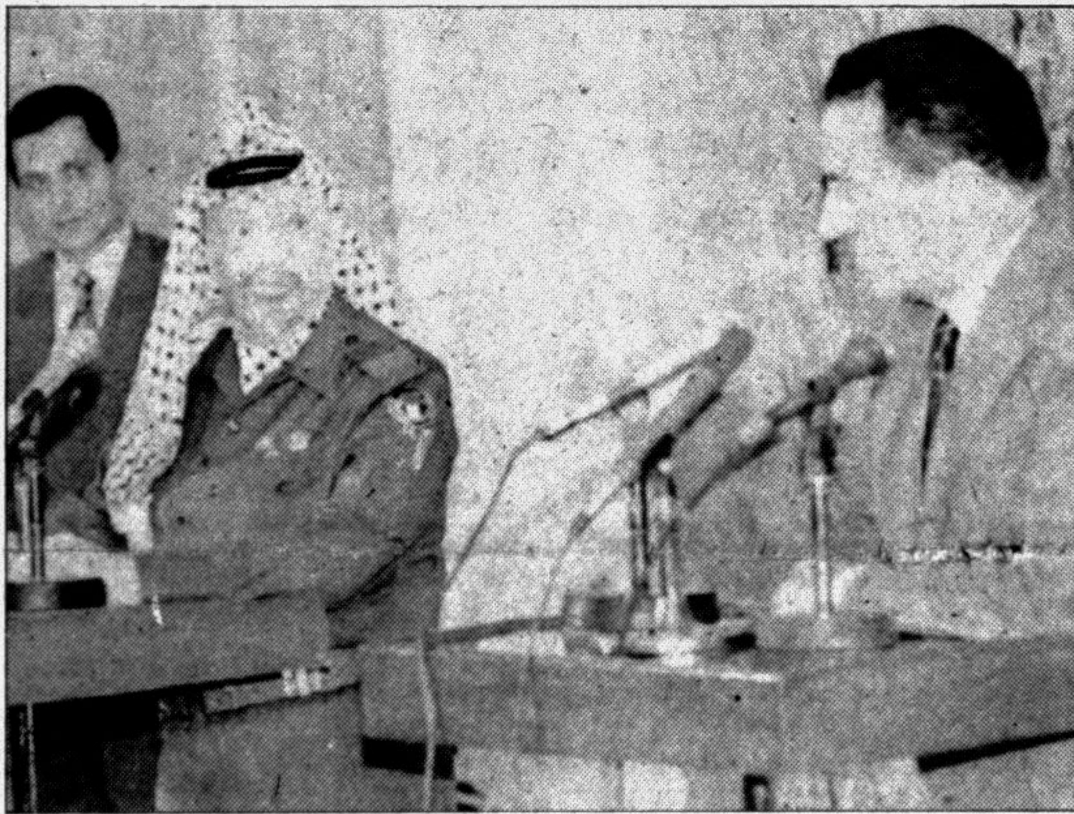
PLO leader Yasser Arafat listens to Egyptian President Hosni Mubarak during a press conference in Cairo yesterday prior to his historic visit to the Gaza Strip.