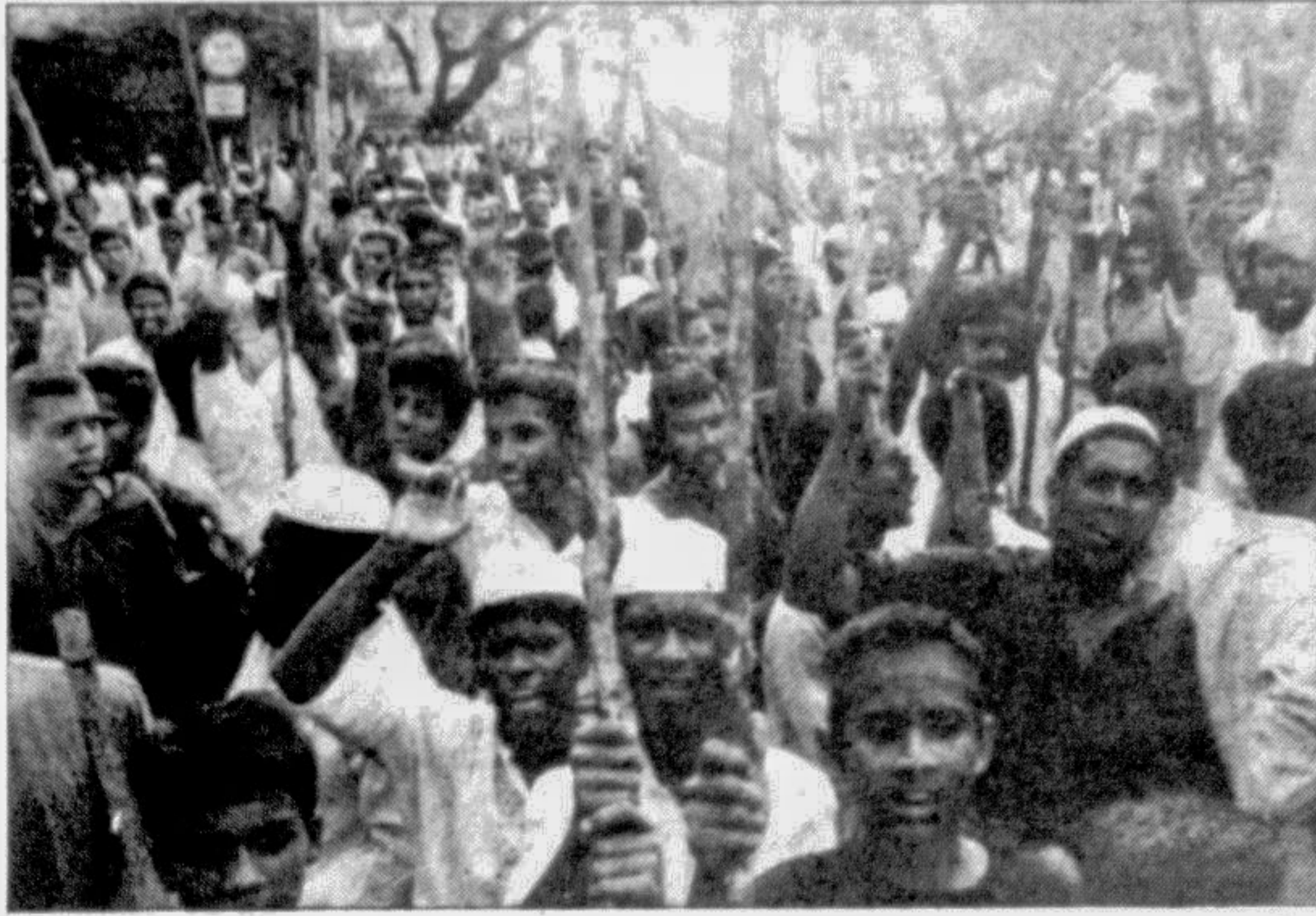
Jamaat activists brought out a procession brandishing sticks during the hartal hours in the city yesterday.

The 14th annual international conference of the Aga Khan Education Service began yesterday at a local hotel in the city, reports UNB. Delegates and observers from USA, Canada, France, Switzerland, Kenya, Tanzania, Uganda, Syria, India, Pakistan and home country are participating in the conference. The Aga Khan Education Service operates over 300 schools — including one in Dhaka — providing education to over 45,000 students worldwide as part of the Aga Khan Development Network.