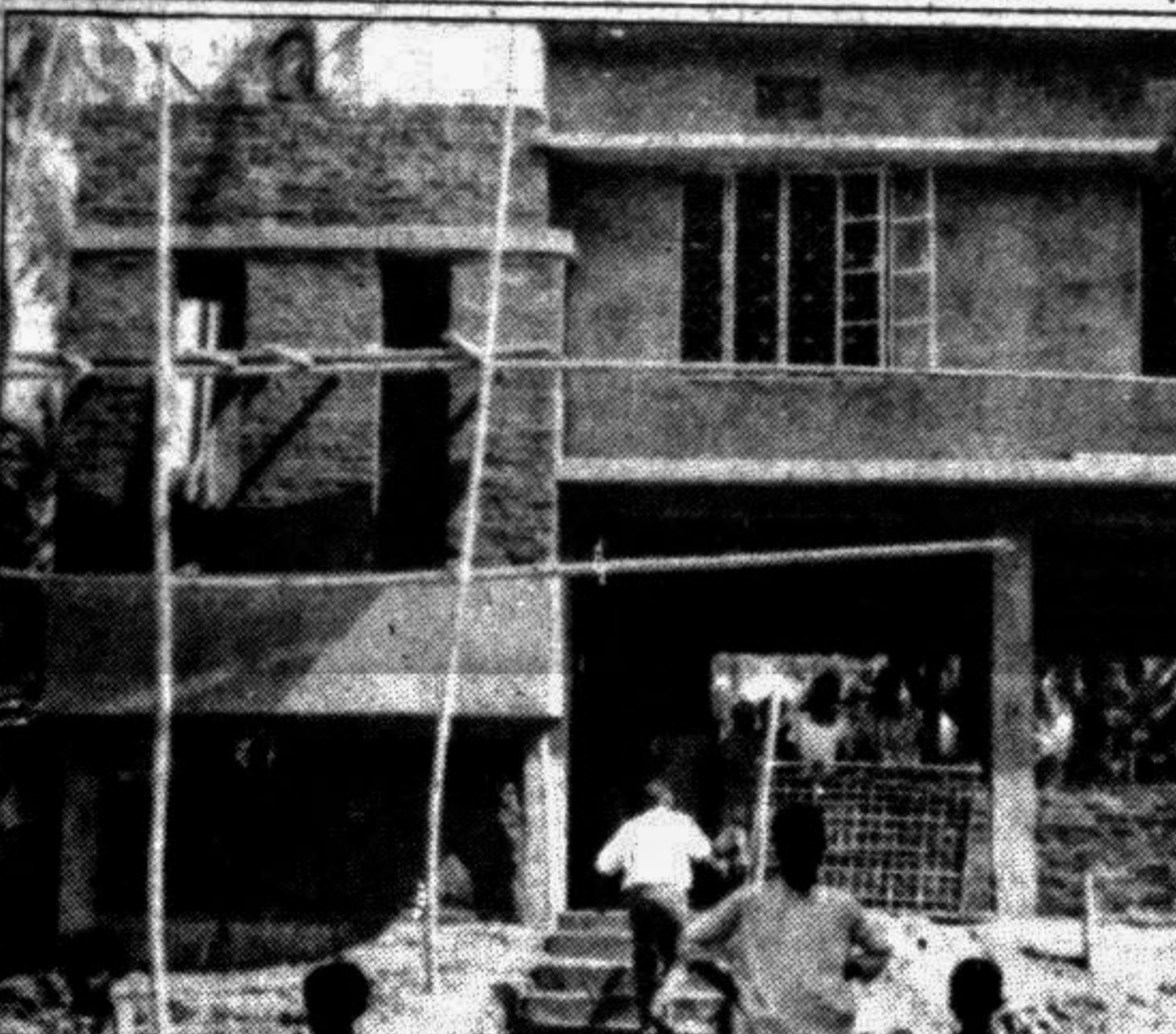
CHITTAGONG: Milon, a community support network recently celebrated its third birth anniversary. The organisation helps the poor specially the women and children to provide free education, health services and arranges income generating projects for women. Last year the organisation built a two storeyed mosque-cyclone shelter (picture) in Banskhali on a piece of land donated by the people of Bahar Chara. American Network for Services and Relief, ANSAR and Bangladesh Overseas Association of Chittagong, BOAC funded the project. Milon has also established a sewing centre at Halishahar. Products from the centre are sold every year for sources of income.