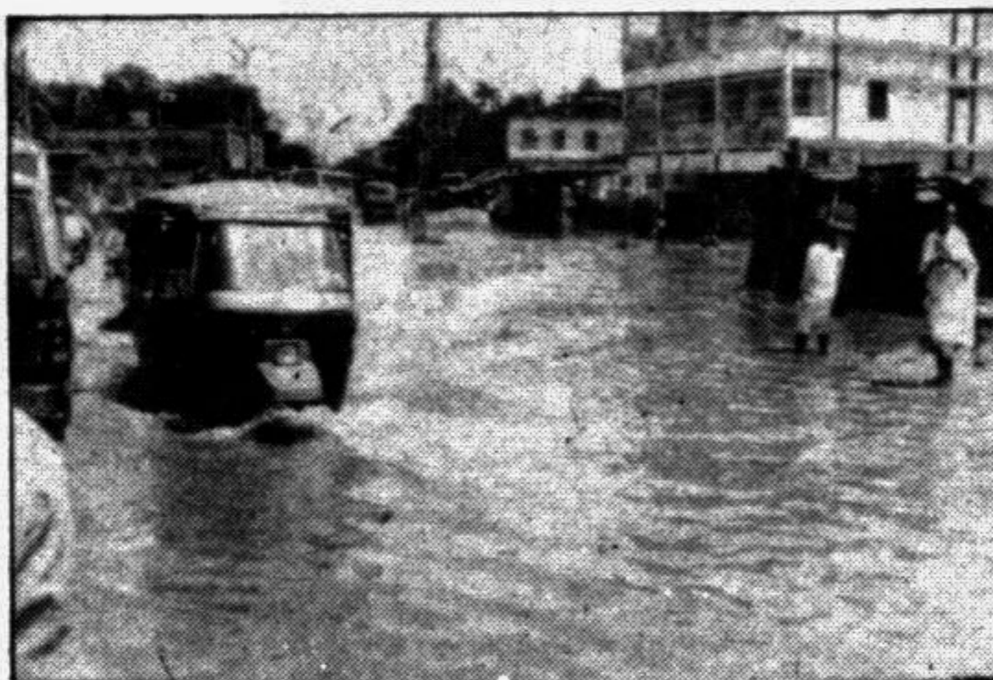
SYLHET: Many parts of the town area are submerged by knee-deep water after a slight rainfall. Picture shows Subidbazar area of the town after three hours of rainfall.

Local elite complained that the addicts use drugs freely as nobody dares to protest them. Members of the law enforcing agencies are found reluctant to take action against them, they alleged.