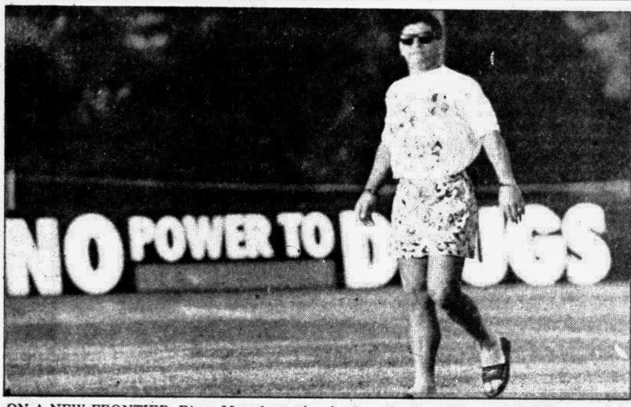
ON A NEW FRONTIER: Diego Maradona, the charismatic Argentine captain takes a quiet stroll at the Babson College in Wellesley after a practice session on June 26. The writing on the boarding provides a fitting background.