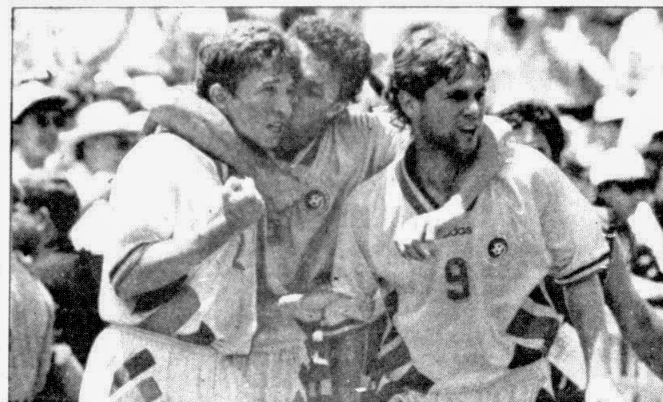
WELL DONE: Romania's Dan Petrescu (L) gets a peck on the cheek from teammate Gheorghe Popescu (C) after he scored the only goal against USA in their final Group A match at the Rose Bowl in Pasadena on Sunday. Romania won 1-0 to qualify for the second round.