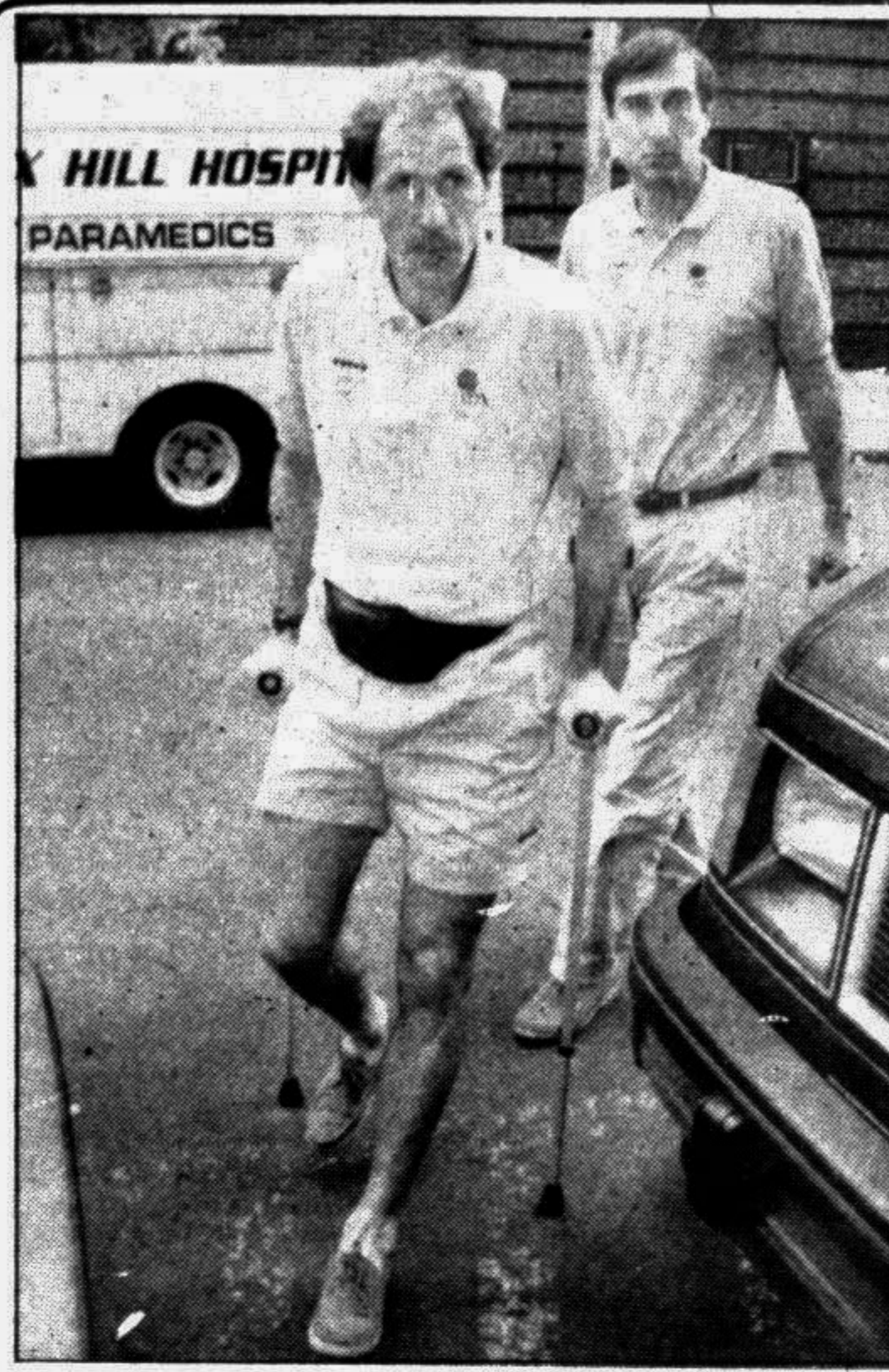
Few days back this man was supposed to bear the burden of Italy's defence. Now Franco Baresi has to walk on props. Well, that's the life of a footballer at any level. The picture shows the now out of action Baresi entering a New York hospital for tests on June 24. Baresi who was injured in the match against Ireland may not take any further part in the meet.