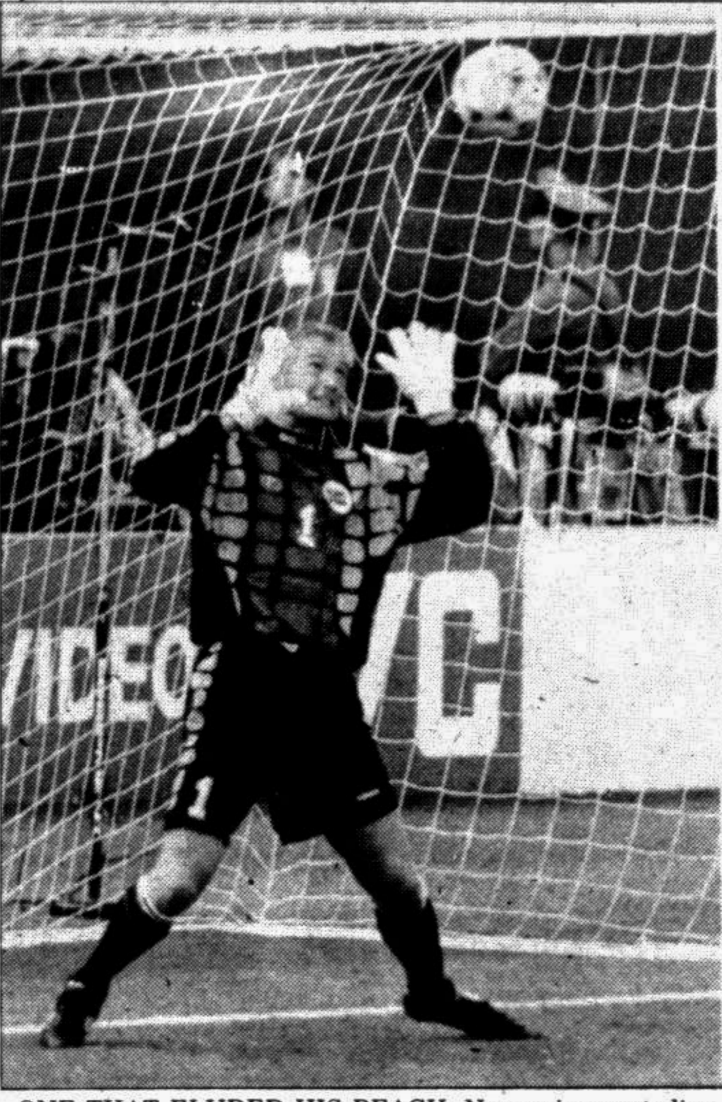
ONE THAT ELUDED HIS REACH: Norwegian custodian Erik Thorstvedt watches in utter despair as a powerful header from Dino Baggio sails over his outstretched hands during a crucial World Cup Group E match at the Giants Stadium on Thursday.