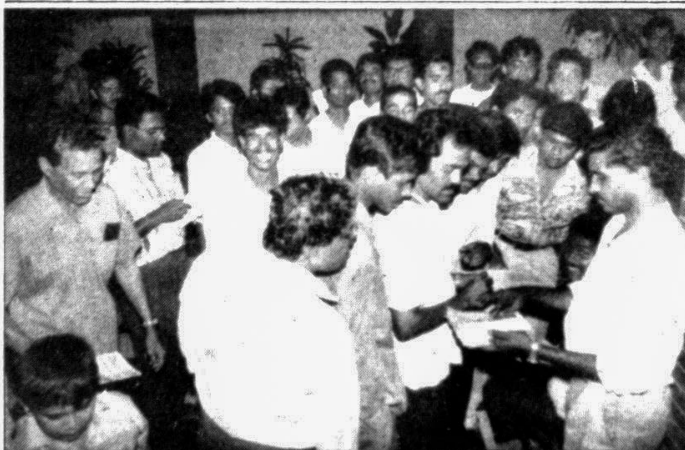
With the deadline for The Daily Star World Cup Bumper Quiz expiring at ten last night thousands of eager soccer buffs came to the newspaper office throughout the day yesterday to submit their answers for tomorrow's lucky draw. This picture was taken at the stroke of ten last night.

Over 50 rounds of gunshots and hundred cocktail blasts were heard during the two-hour fight. Police opened 20 rounds of blank fire and lobbed 15 rounds of tear gas shells.