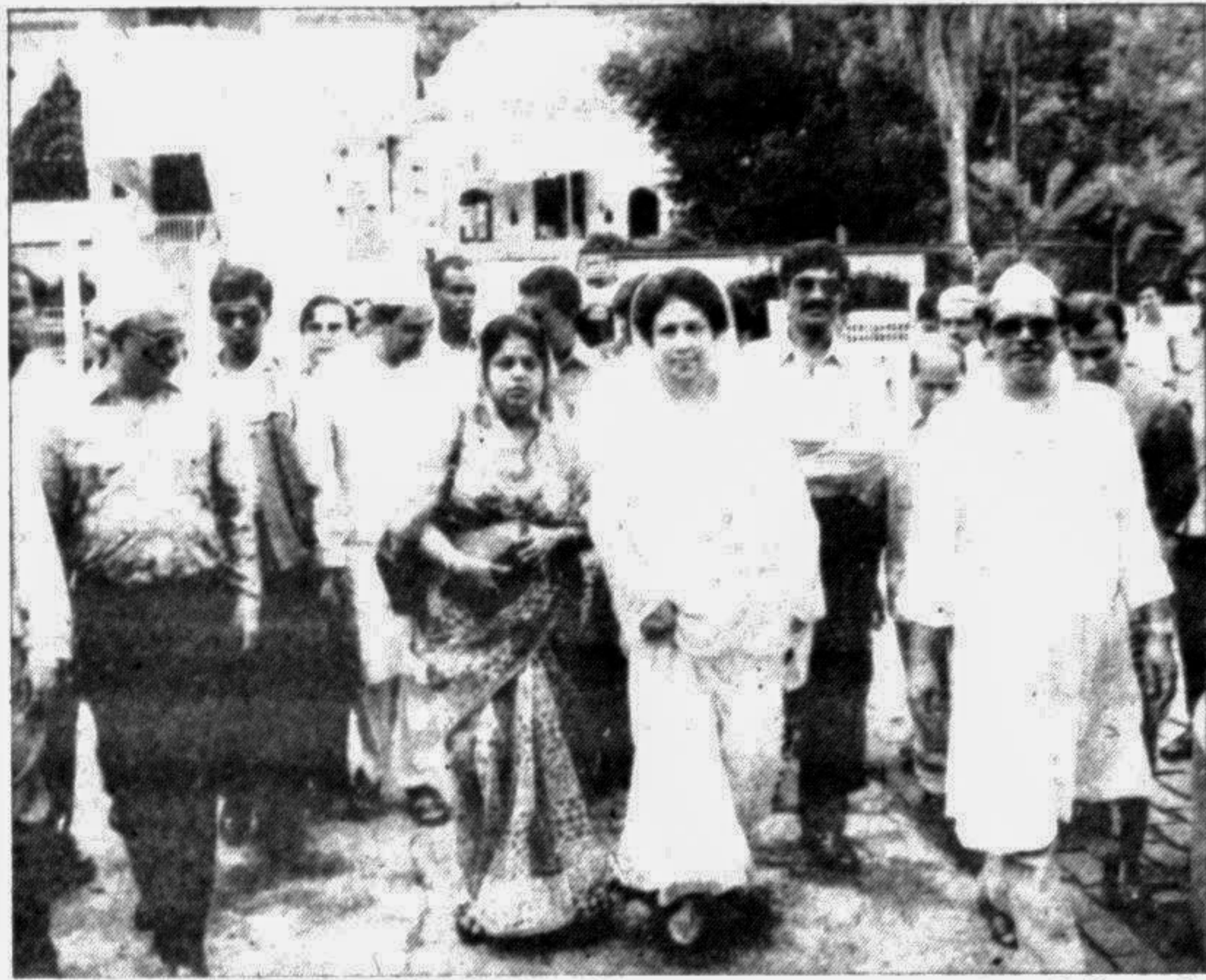
Prime Minister Begum Khaleda Zia visited the mazar of Hazrat Shahjalal(R) at Sylhet and offered fateha there yesterday.

The CSM is composed of seven manufacturing units and has a production capacity of 1,46,000 tonnes of MS billet, 72,000 tones of MS plate, 60,000 tonnes of MS sheet and 10,000 tonnes of other steel products a year. The seven units of the CSM are: the melting shop, the blooming mill, the bar mill, the sheet and plate mill, the heavy plate mill, the galvanizing shop and the casting and forging shop.