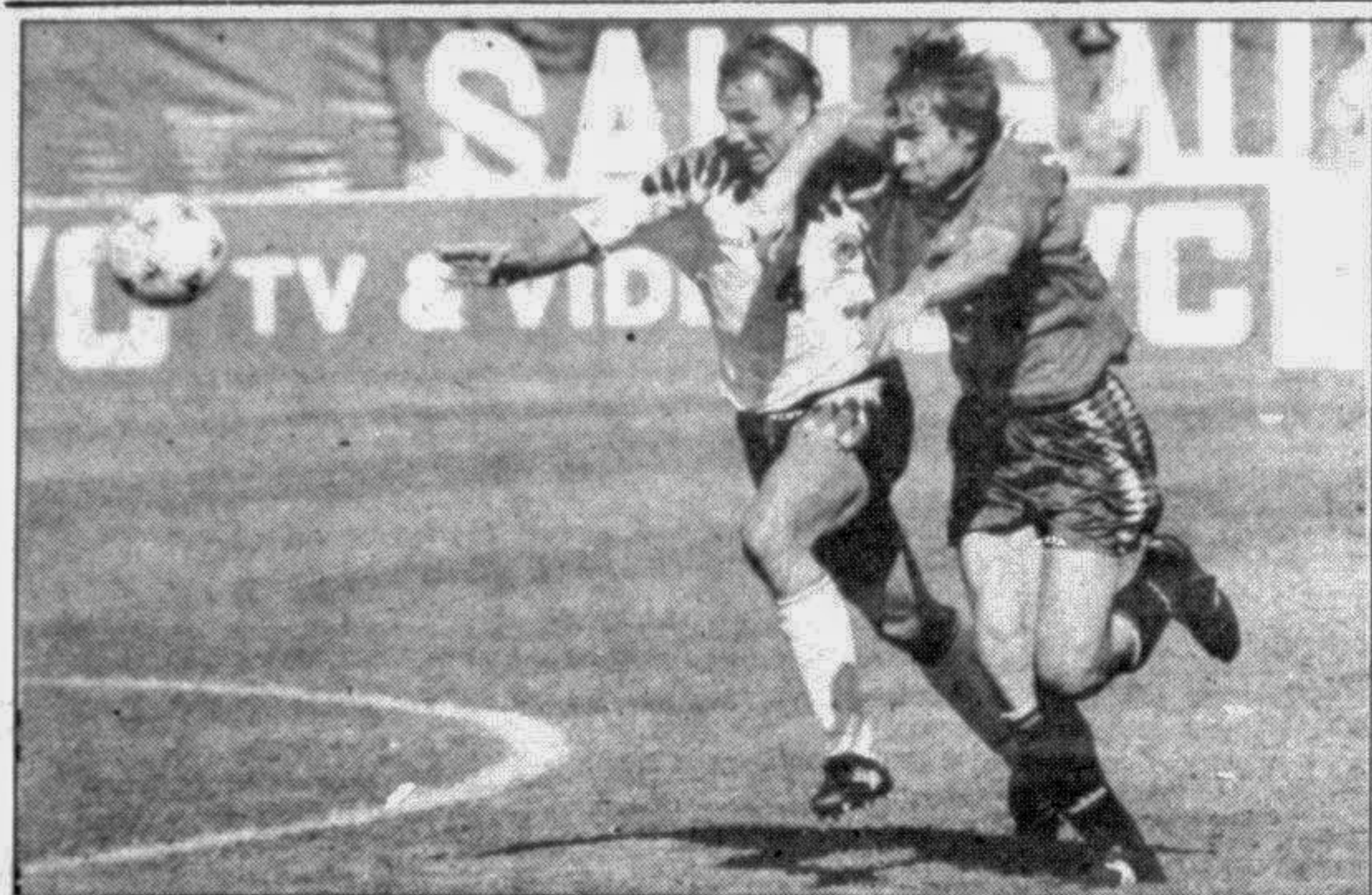
Germany's Juergen Kohler (L) and Spain's Julio Salinas in a hot pursuit to get to the ball during their Group C World Cup match at the Soldier Field Stadium in Chicago on June 21. The match ended in a 1-1 draw.