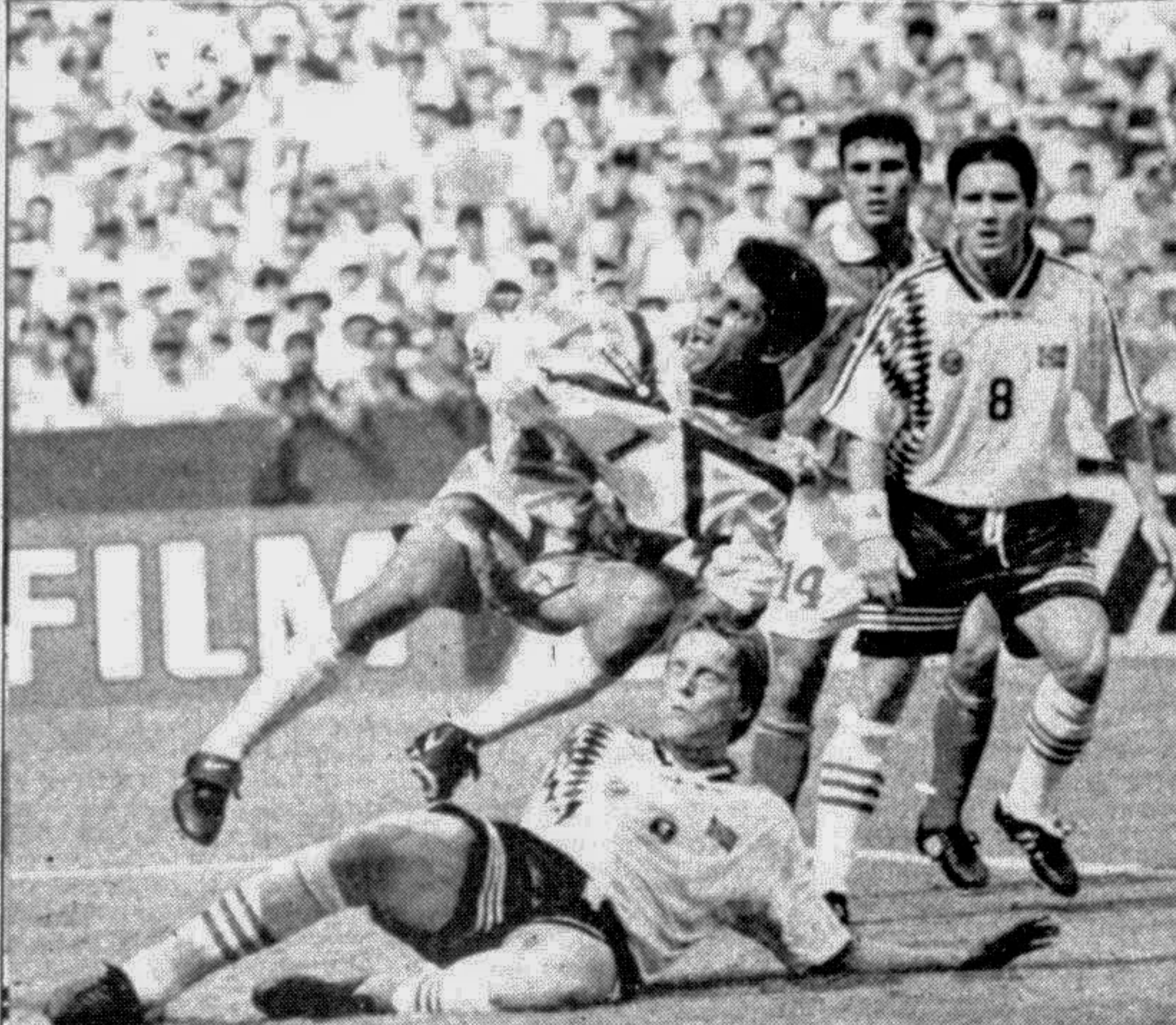
Mexico's flamboyant custodian Jorge Campos (sporting number 1 jersey) has a busy moment during his side's Group E opener against Norway at the RFK Memorial Stadium on Sunday. Norway recorded their first ever World Cup win, 1-0.