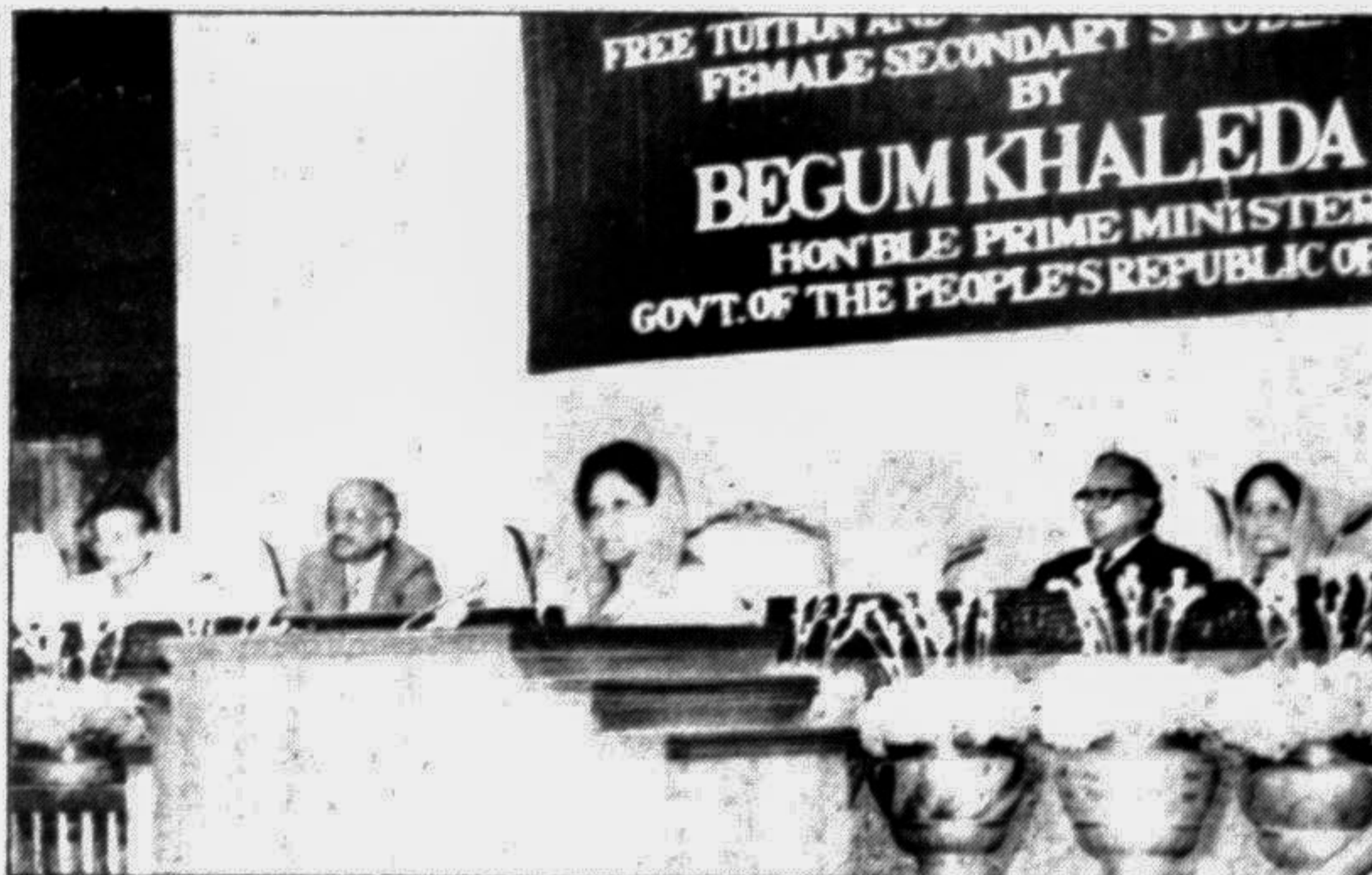
Prime Minister Begum Khaleda Zia addressing the launching ceremony of the programme of stipend for girls at secondary schools and madrassahs in the country at the International Conference Centre in the city yesterday.