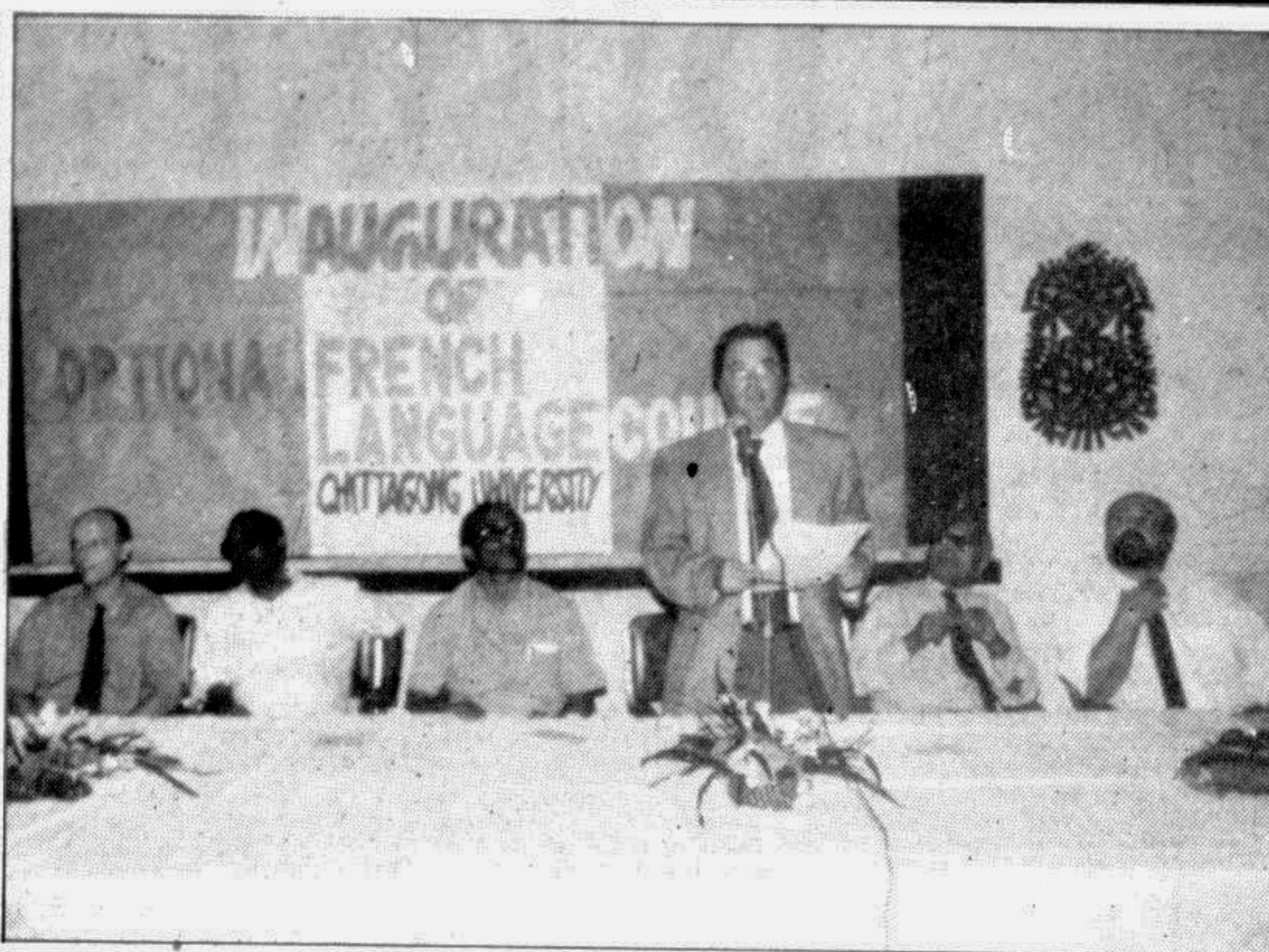
Jean Pierre Arrocau, Counsellor of French Embassy in Bangladesh is seen speaking as guest of honour on the occasion of introduction of optional French language course in Chittagong University held recently.

They also stressed the need for regular dredging in the river-beds to remove the silts to help keep navigation possible.