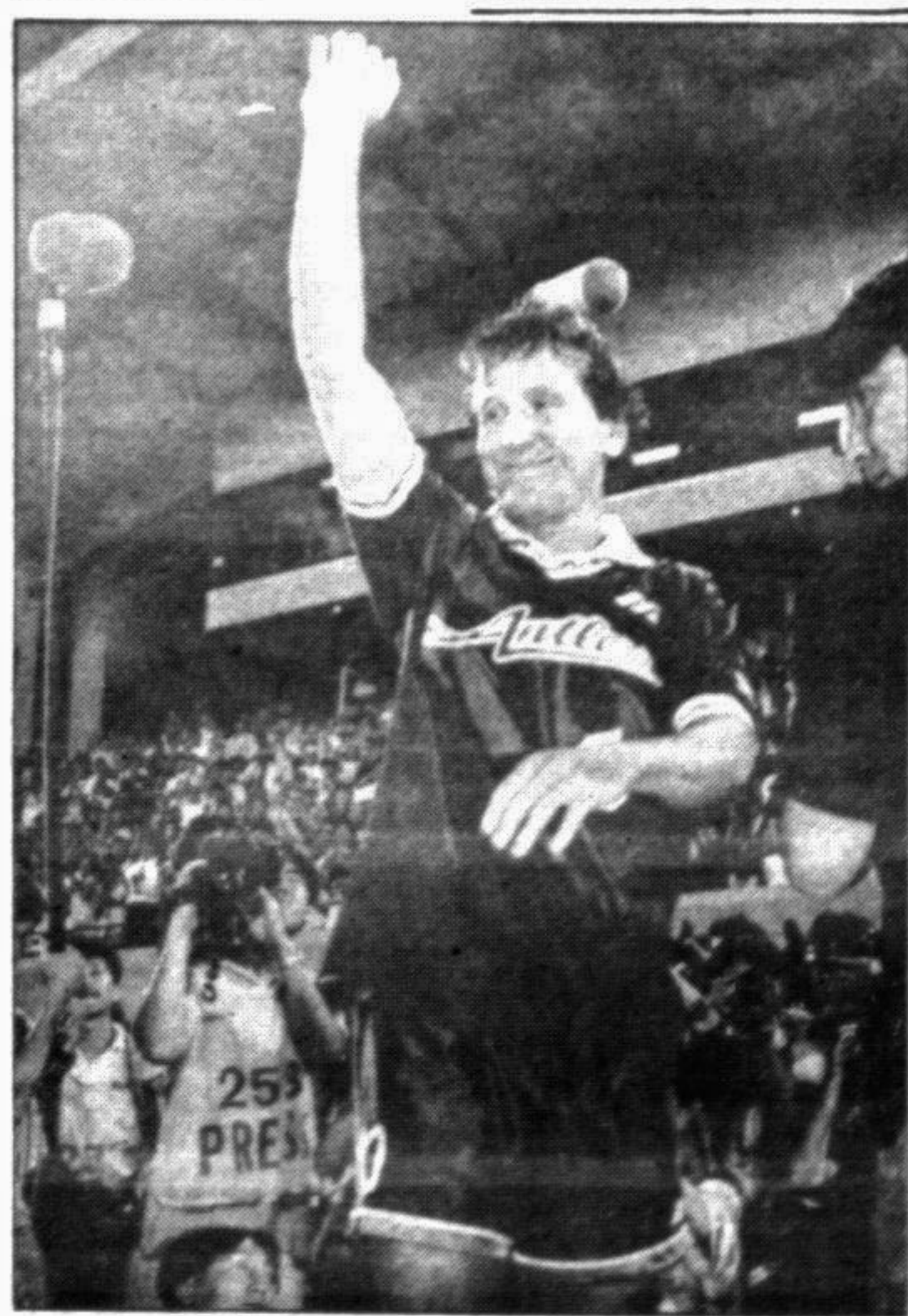
Brazilian soccer star Zico waves to his supporters after playing his last game for Kashima Antlers in the J-League first stage at Iwata City in Tokyo on Wednesday.

Grampus won 1-0 but Lineker's only shot at goal went over the bar.