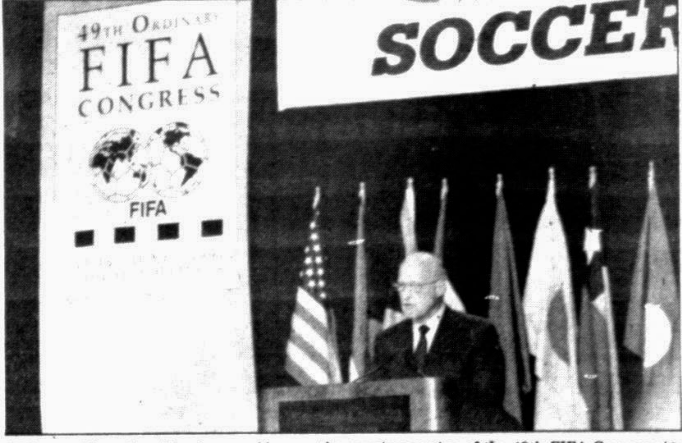
FIFA president Joao Havelange addresses the opening session of the 49th FIFA Congress in Chicago on Wednesday.