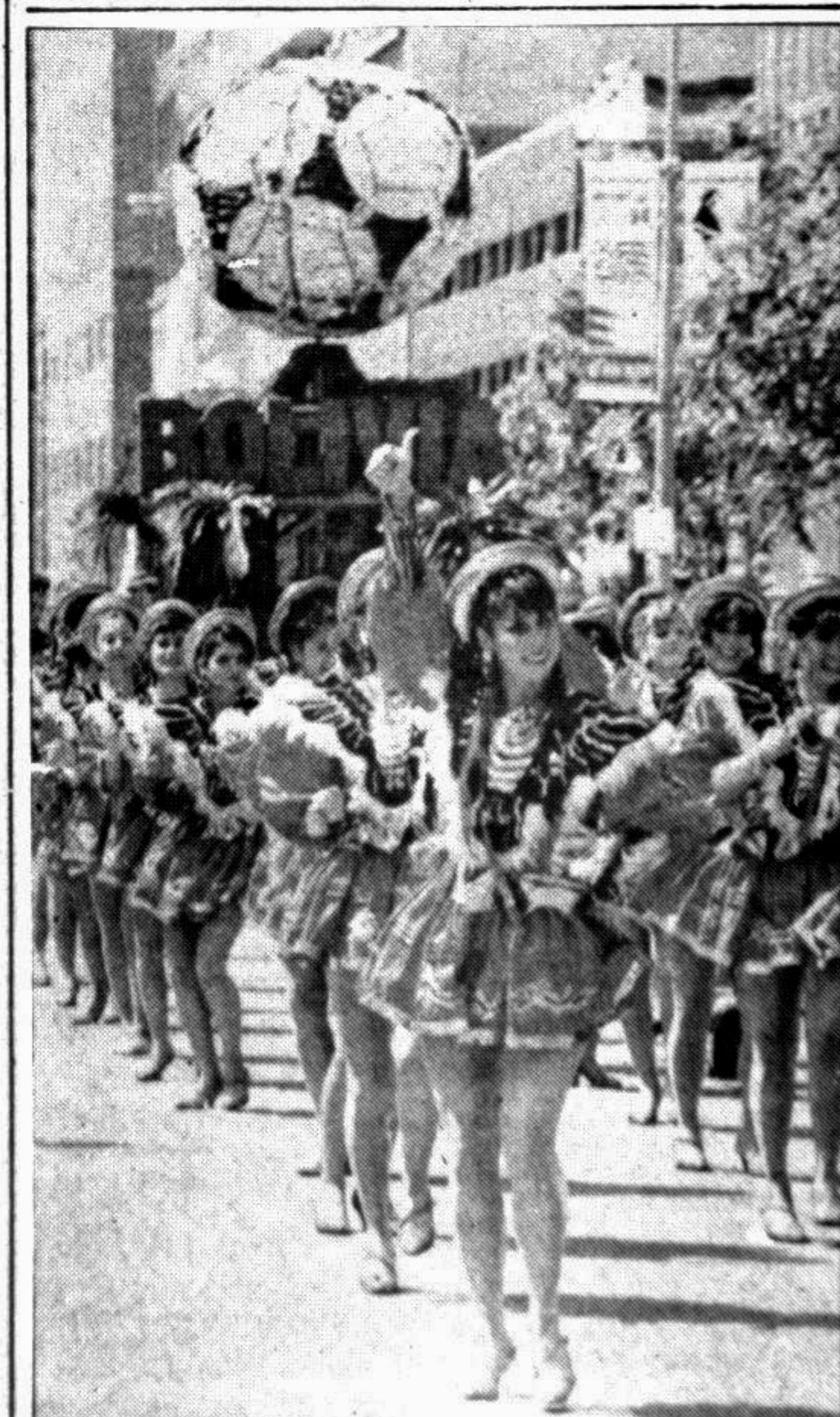
Bolivian dancers perform in front of their country's float during the 'Chicago Welcomes the World Cup' parade along Michigan Avenue on Wednesday. Football's showcase event kicks off today with defending champions Germany taking on Bolivia at the Soldier Field.

The Mexican float drew frenzied applause from the crowd while Dutchmen on bicycles handed out tulips. Hundreds of young American soccer players brought up the rear of the parade which lasted about 2-1/2 hours.