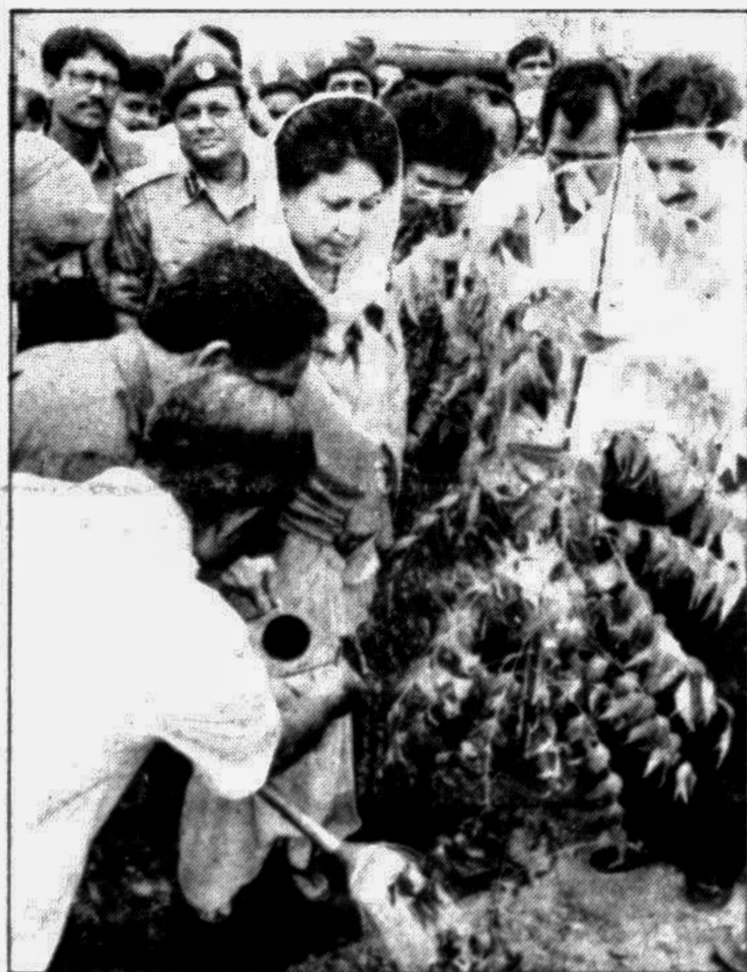
Prime Minister Begum Khaleda Zia inaugurating the National Tree Plantation Campaign '94 by planting a Neem sapling at Enayetpur in Chapai Nawabganj district yesterday.

ENAYETPUR (Chapai Nawabganj), June 15: Prime Minister Begum Khaleda Zia today launched a nationwide tree plantation programme turning afforestation into a social campaign to maintain country's ecological balance, reports UNB.