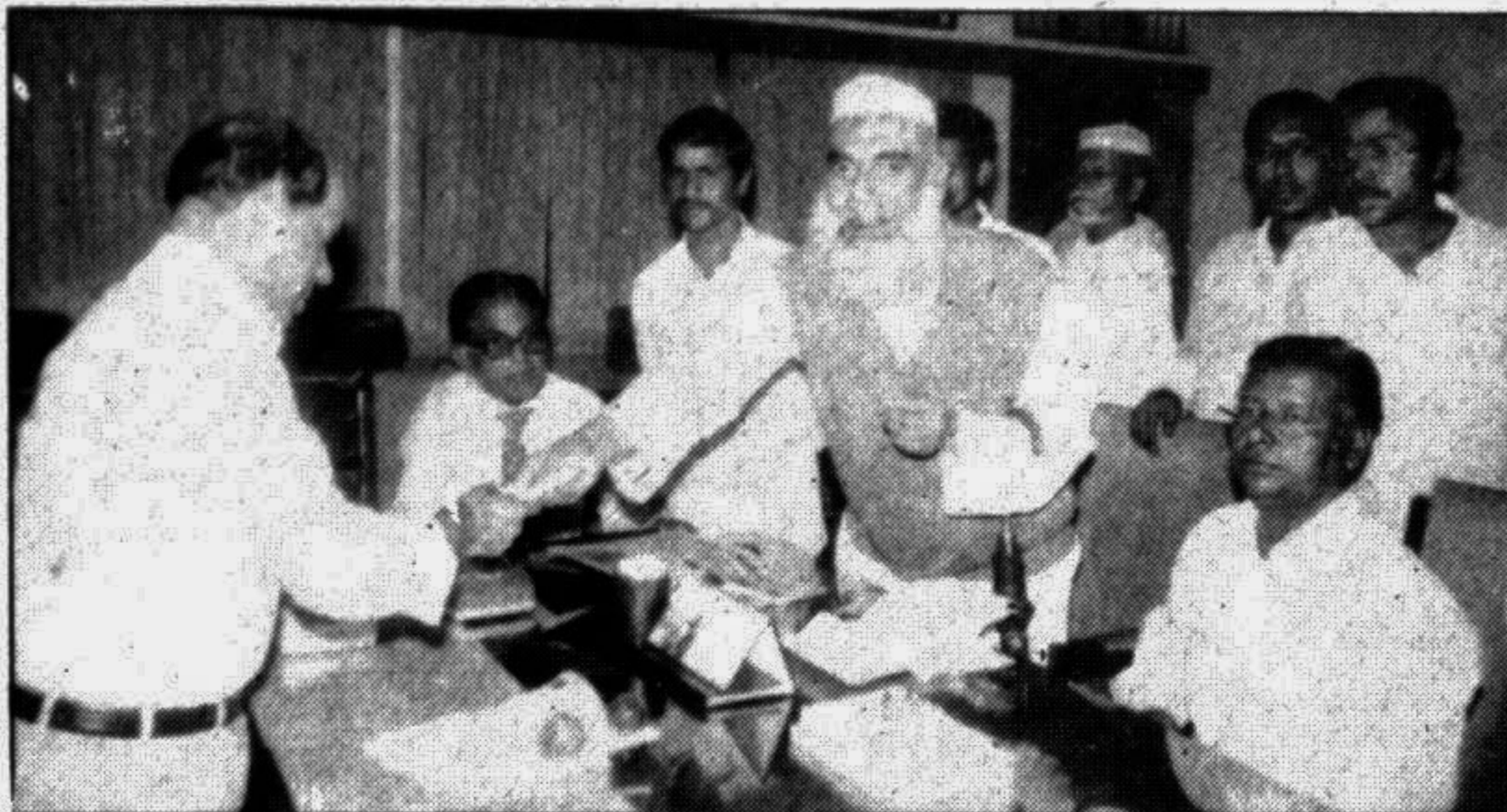
SYLHET: The leaders of greater Sylhet Ganadabi Parishad handing over a memorandum to the Deputy Commissioner recently. The council members called to realise major demands of the greater Sylhet region.

The thana and district headquarters plunge into darkness for hours together on every alternative nights, stopping production in mills and factories and hampering transactions in commercial centres and markets.