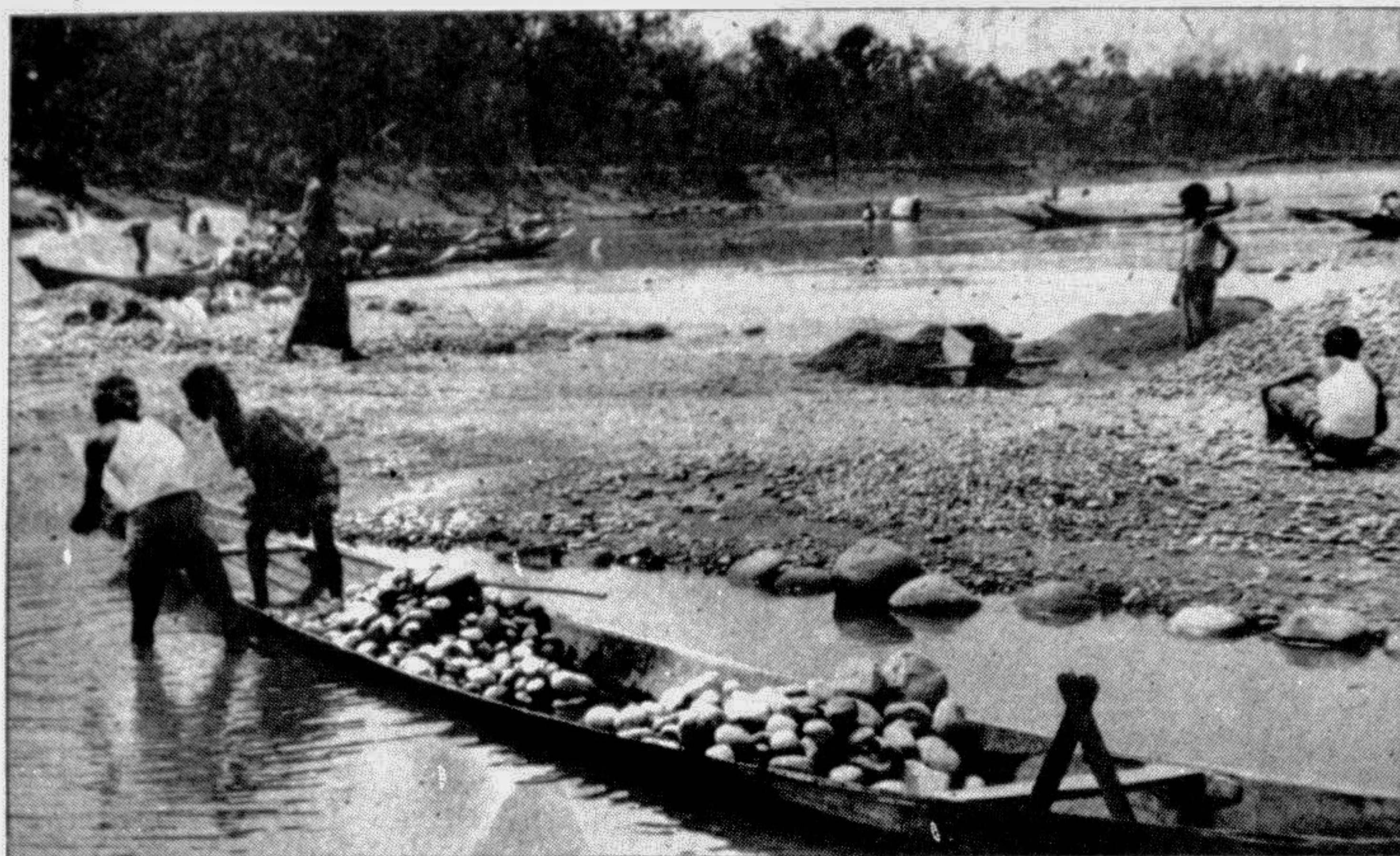
JAFFLONG (Sylhet): This region, bordering India, has become an important business centre. Thousands of tons of stones are collected from this area for use as part of construction material. Small boats, specially designed, like this one carry stones to the river bank to be transported to other districts of the country.