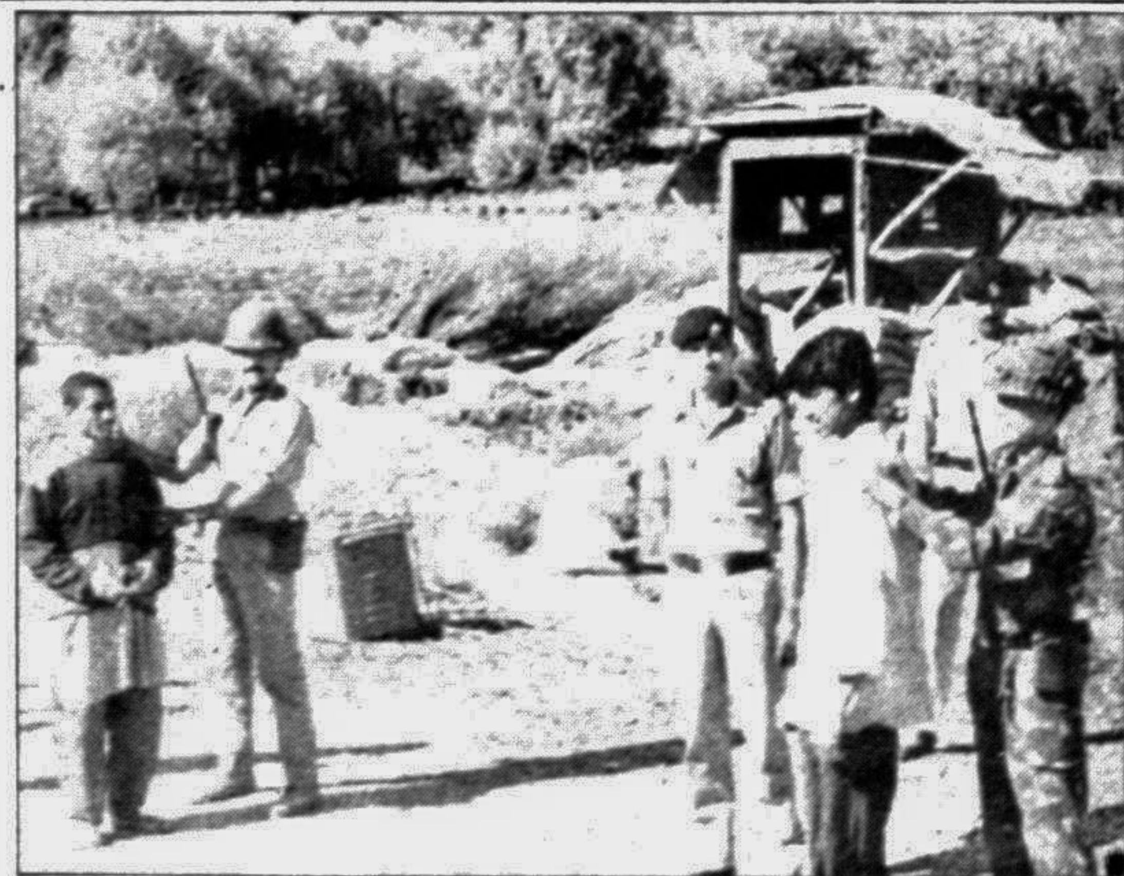
Indian troops parade suspected Kashmiri militants before an informer or 'cat' (not in picture) in northern Kashmir where Muslim militants are waging a secessionist campaign against India. The 'cats' are concealed inside an armoured vehicle or bunker for their safety.