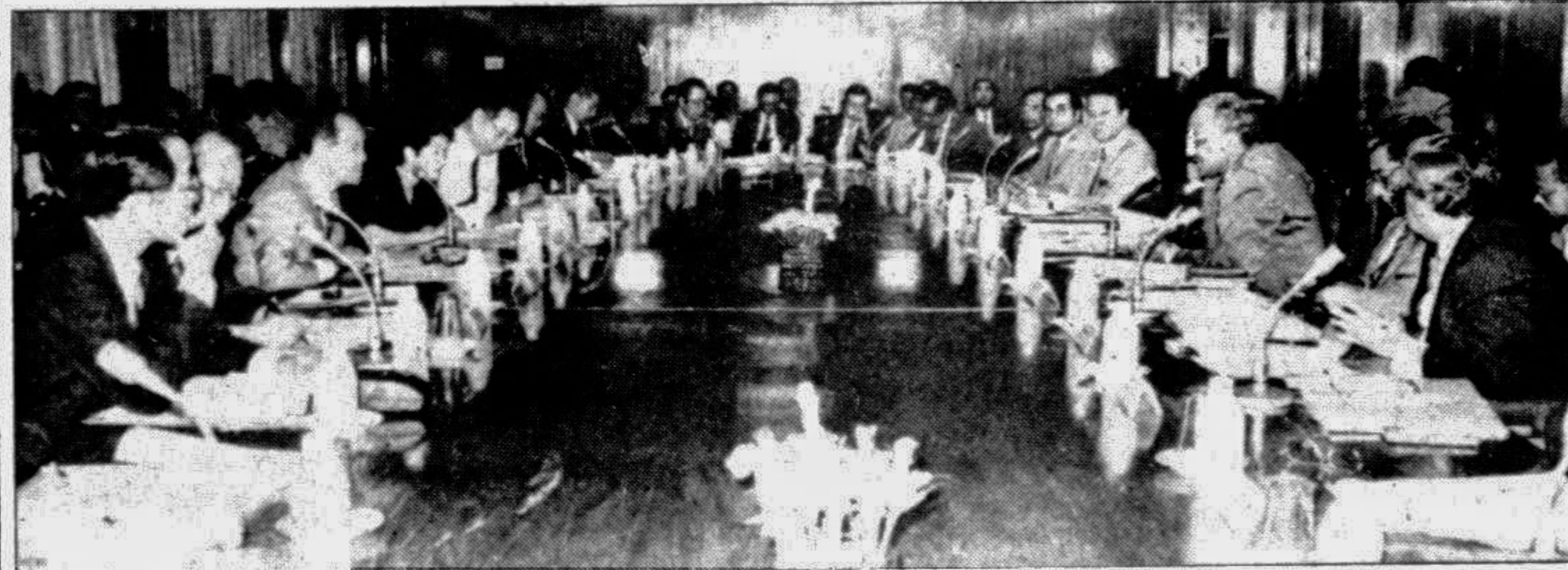
The formal talks between the visiting 40-member Japanese investment delegation and the Bangladesh side in progress at the Secretariat's cabinet room yesterday.