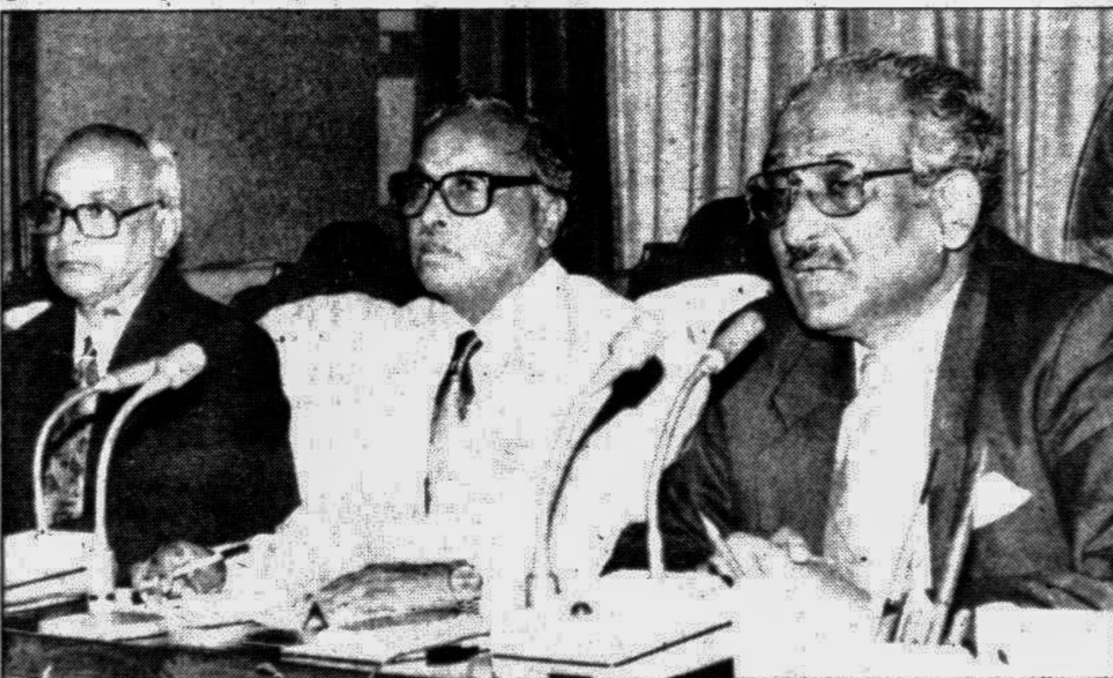
Finance Minister M Saifur Rahman speaking at a post budget press conference at the Jatiya Sangsad yesterday. On his left are Education Minister Jamiruddin Sircar and State Minister for Finance Mojibar Rahman.

According to the recently See Page 12 Col 7