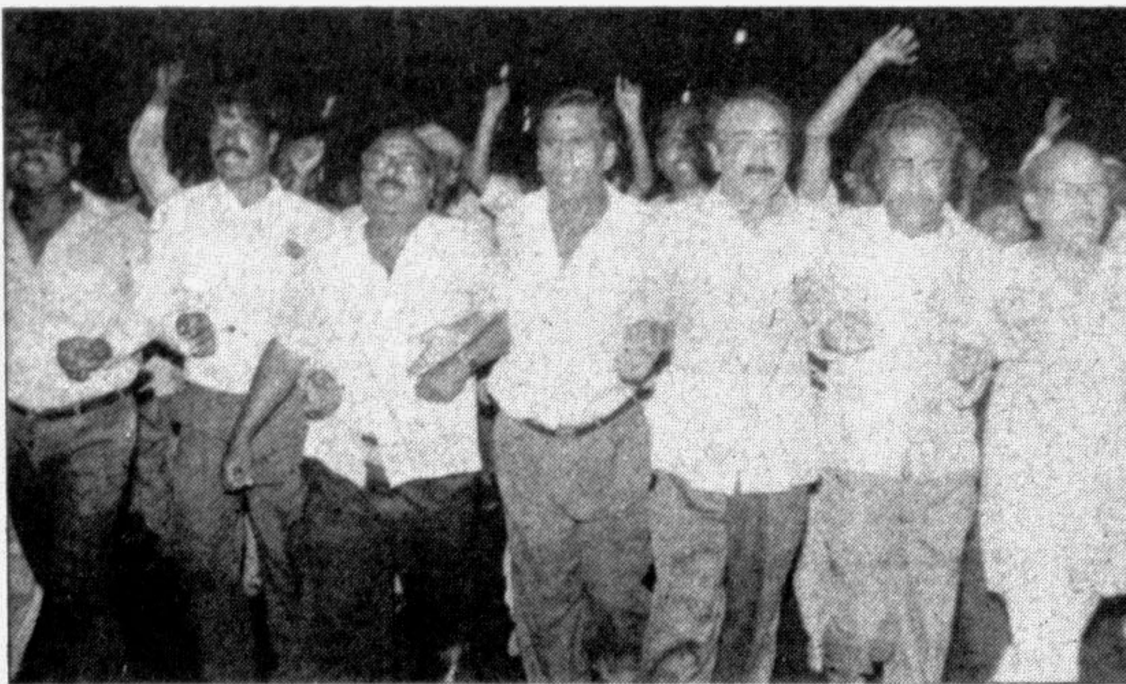
The Awami League brought out a procession in the city yesterday evening rejecting the proposed budget.