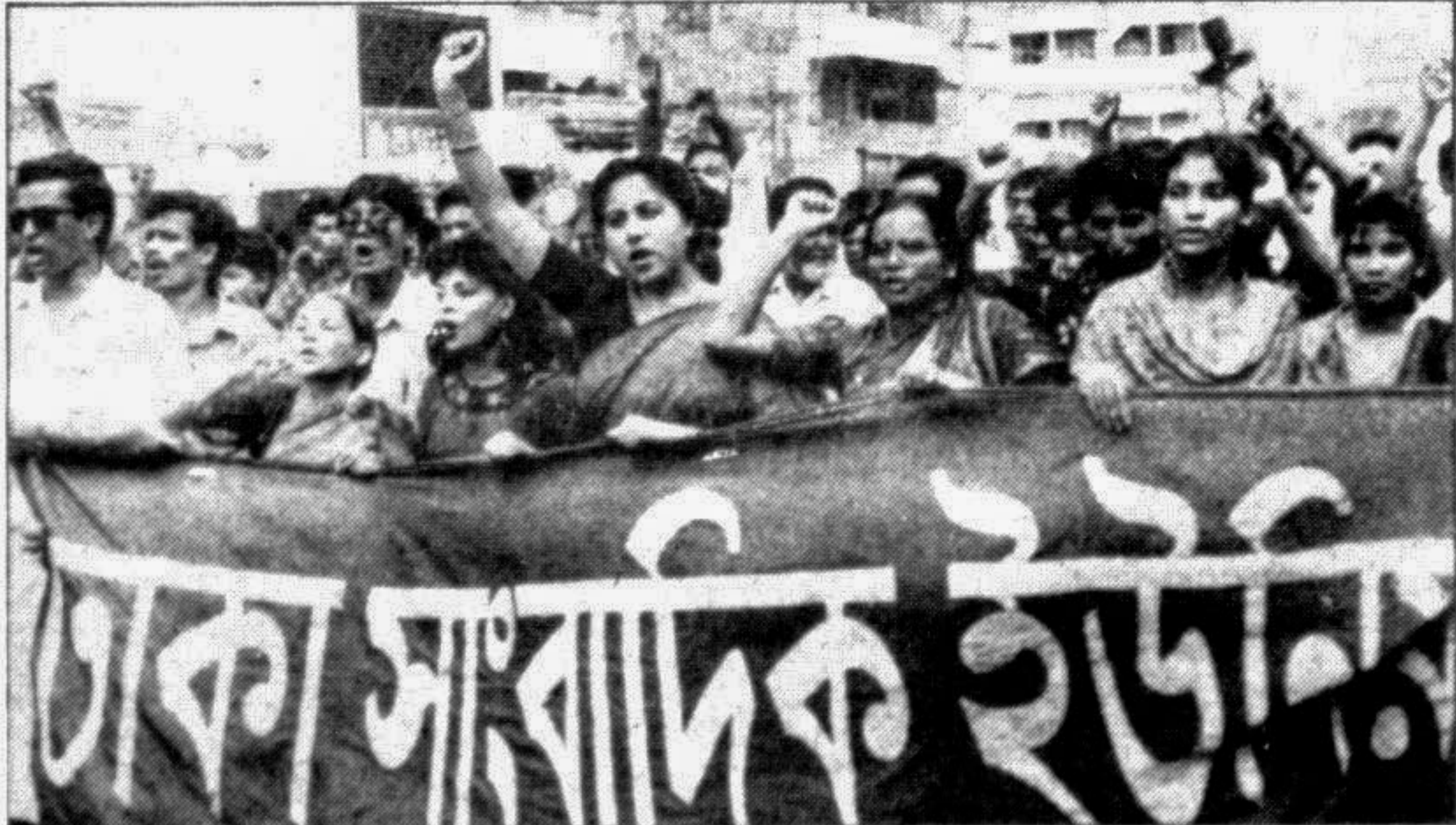
Dhaka Union of Journalists (DUJ) brought out a procession in the city yesterday protesting the arrest of the Janakantha editors.