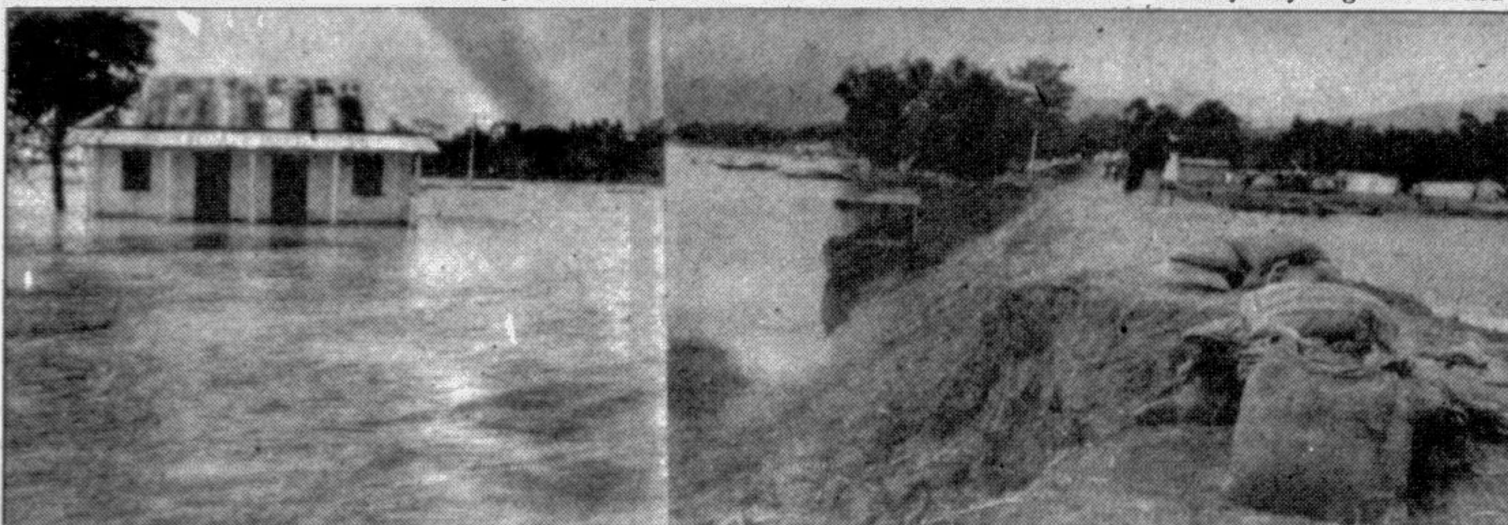
SYLHET: A primary school inundated by the flood waters (L). Villagers using sand bags to close a breach on an embankment in Companiganj thana.

Standing crops on more than five thousand acres of land went under waters while about two thousand dwelling houses have been badly damaged in Dubag, Alinagar, Sheela, Kurarbar and Muria unions of Beanibazar thana on Sunday. A young man named