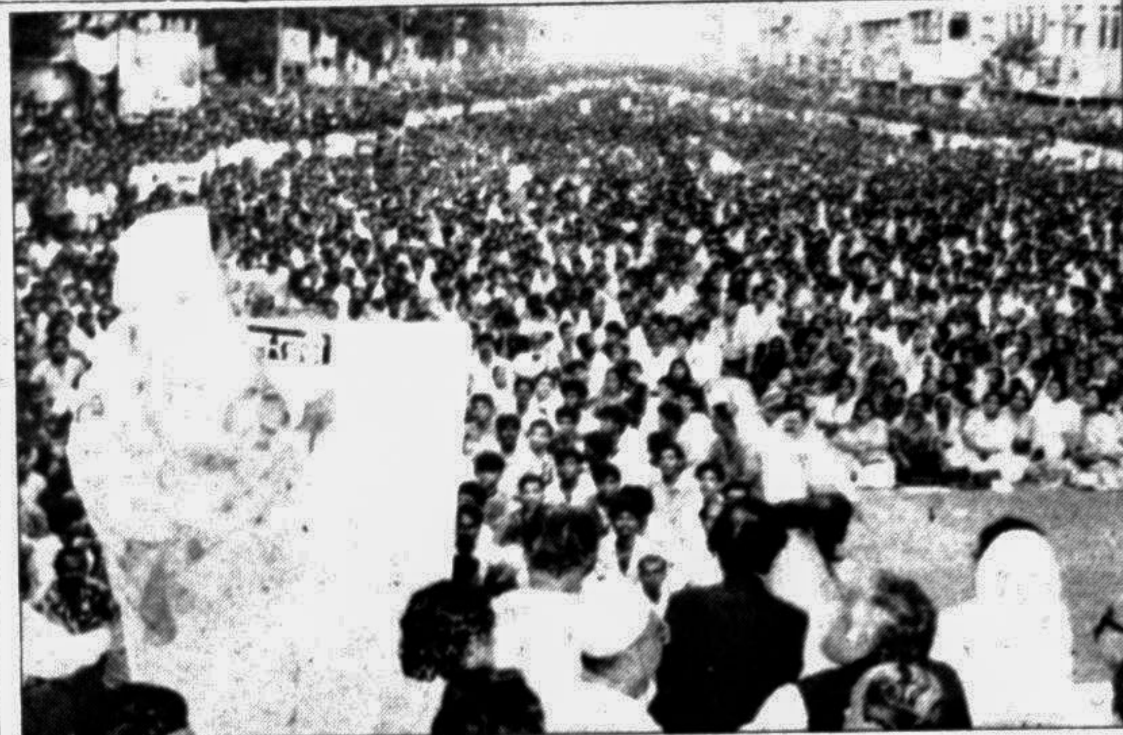
Awami League chief Sheikh Hasina addressing a public meeting at Bangabandhu Avenue in the city yesterday.