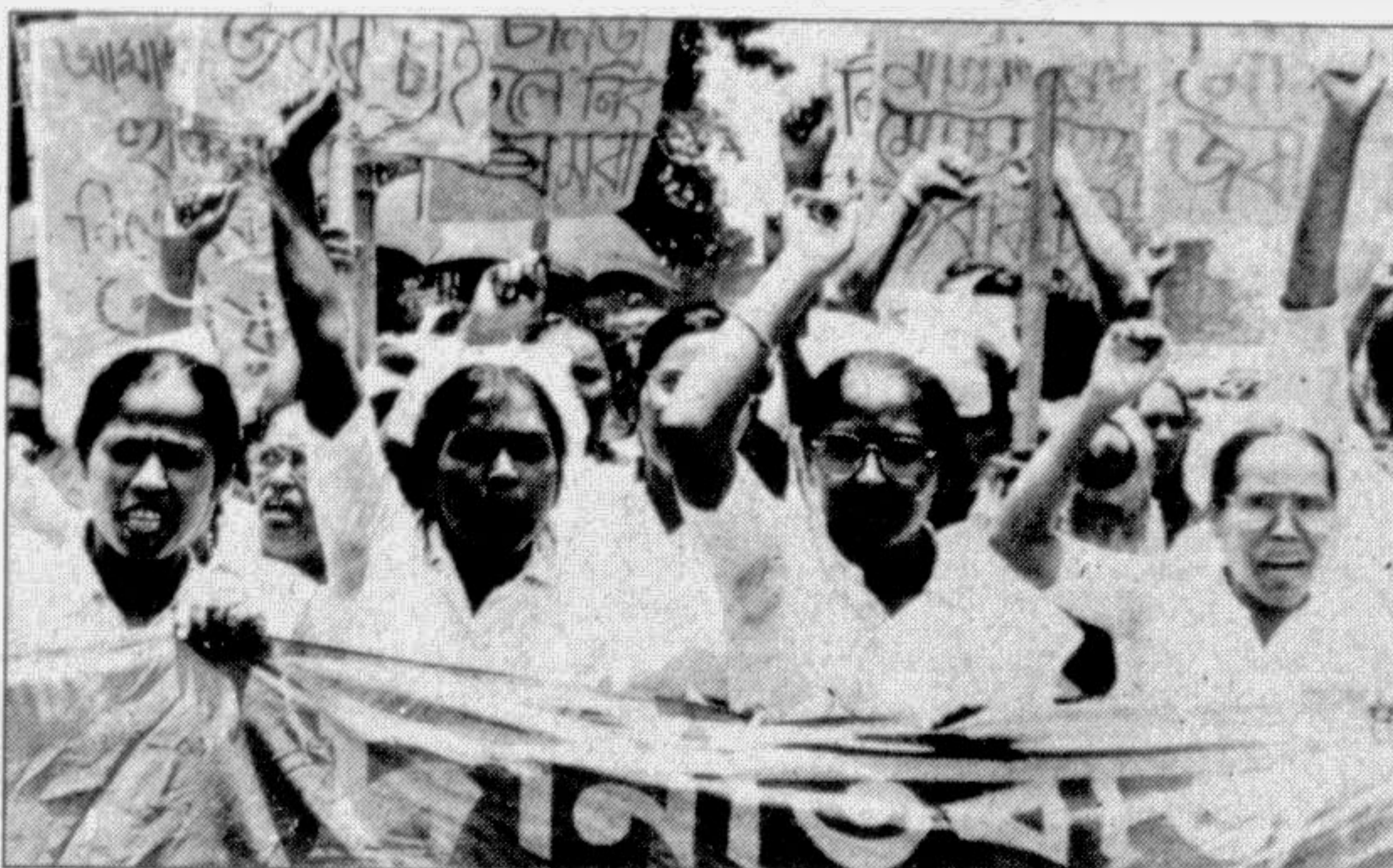
Nurses and employees of the Islamia Eye Hospital brought out a procession in the city yesterday protesting the alleged irregularities at the hospital.

Sitting in a mango grove or under a 'jaam' tree eating the sun-kissed fruit, is a luxury that only they can enjoy. Thus the popular folk song goes: 'Josthi mashe mishti kotha, gache paka aam, tumi jodi thakia bondhu, tomareo ditam' — translated as 'Jaistha month is a month of sweet talk and ripe mangoes on the trees, if you my friend (or beloved) were here I would share this with you.'