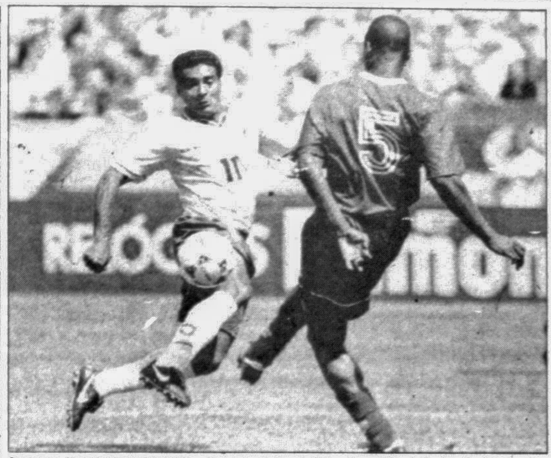
Romario, Brazil's best World Cup bet tries to hoodwink a Canadian defender during a prep match in Edmonton, Canada on Sunday. The hot favourites were held to an uninspiring 1-1 draw.

Eight teams - Bagha Club, Dutch Club, Army Club, Gulshan Club, Dhaka Club, Chittagong Club and British High Commission Club are taking part in the eight-day meet to be played in round robin league basis.