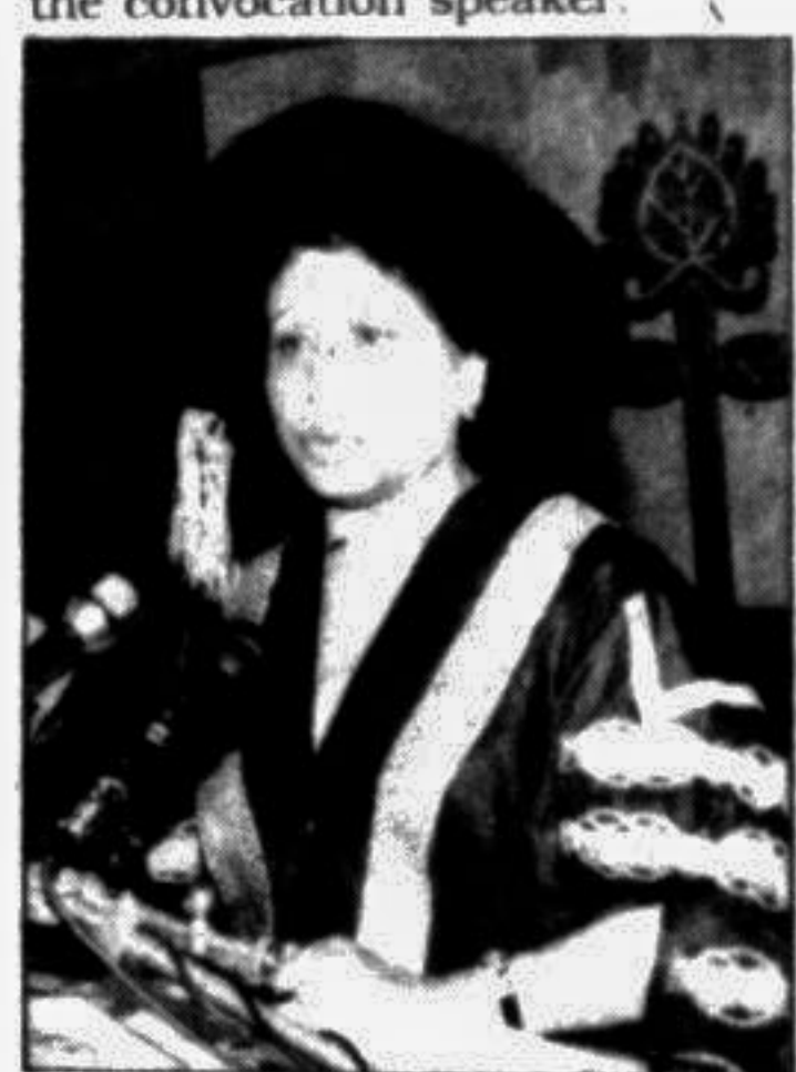
Describing the near self-sufficiency in food production as a great success in the country's agricultural development the Prime Minister said the major contribution for this success came from the Agri-