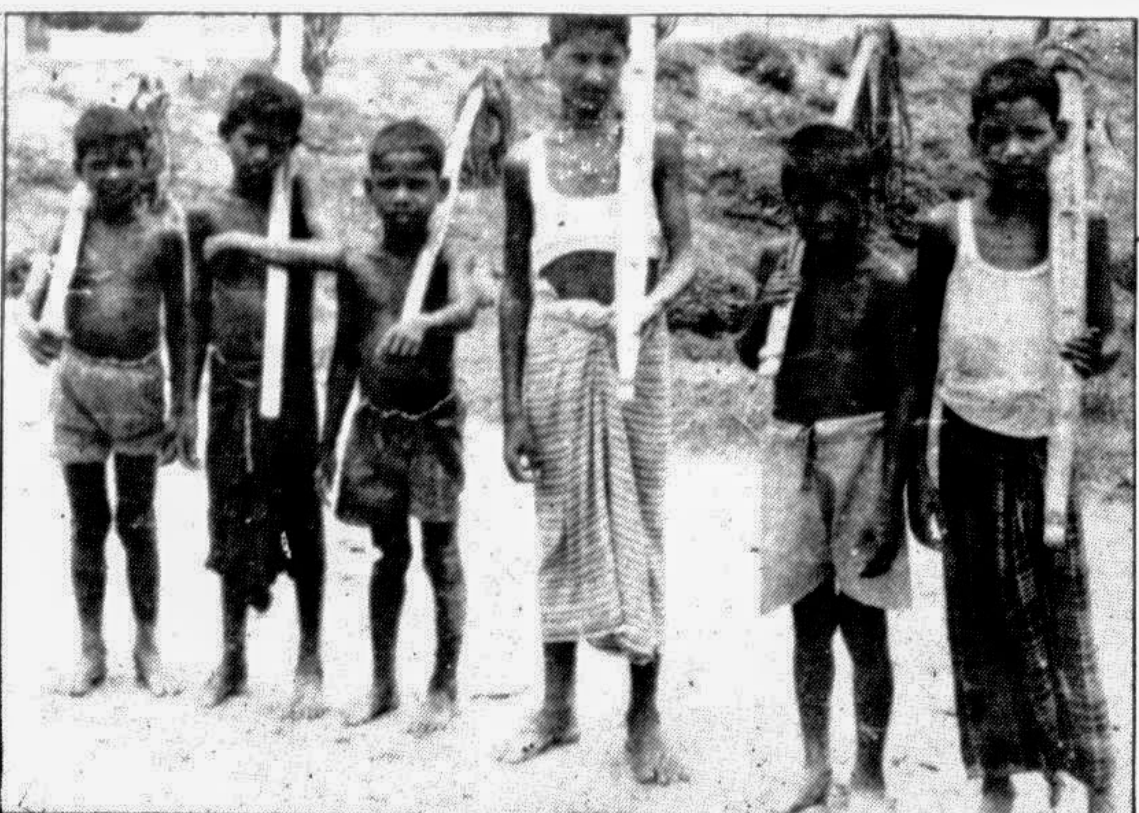
KURIGRAM: These child labourers, supposed to attend school, are on their way to work at a ferry port area. Hundreds of child labourers are found to work at different factories, hotels, brick fields throughout the district.

Several organisations for environmental development and preservation are carrying out various activities to protect the influence of Farakka Barrage in North Bengal and North-Western region.