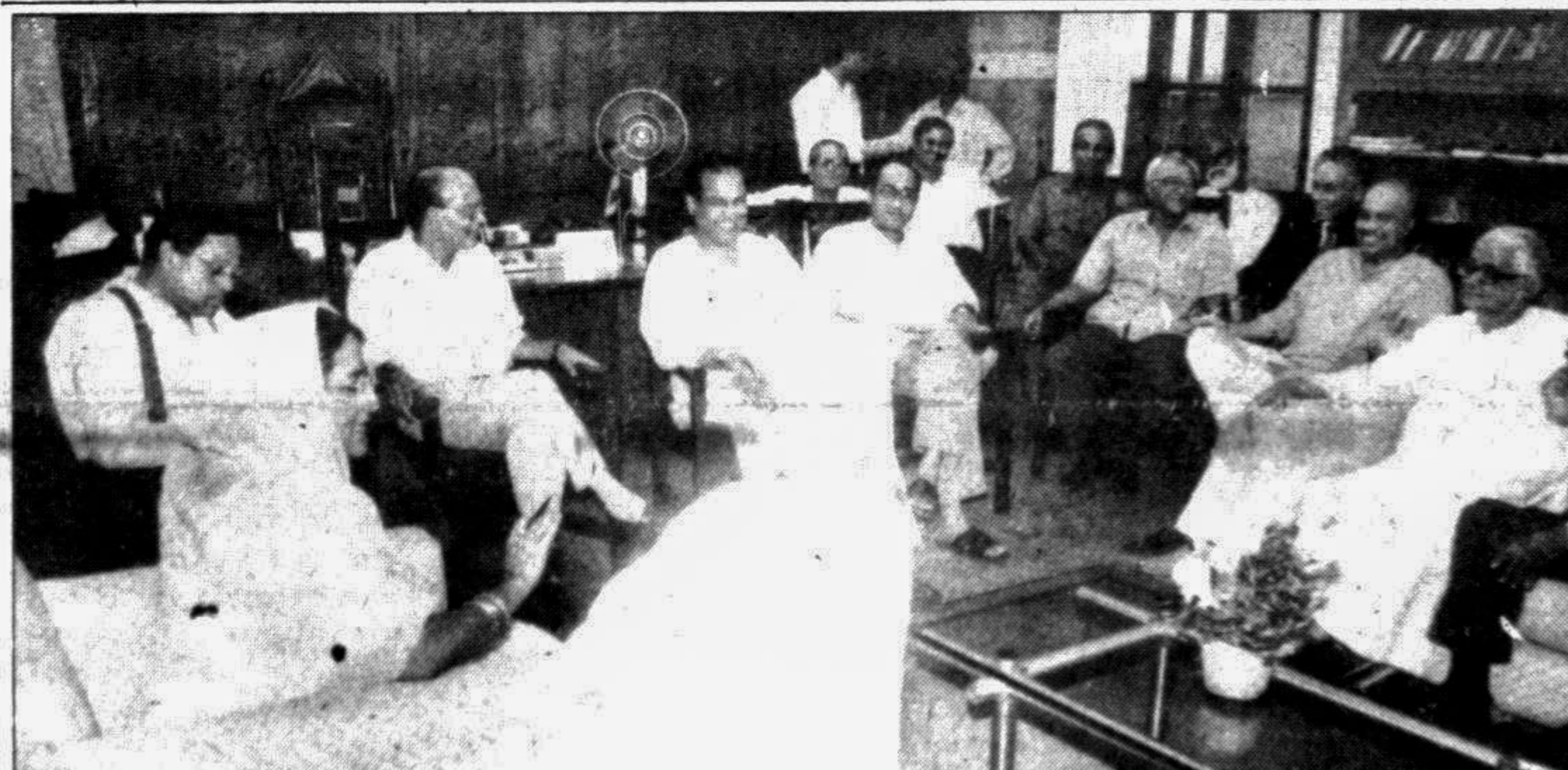
Awami League chief and Leader of the Opposition in Parliament Sheikh Hasina speaking at an all Opposition meet at the Jatiya Sangsad yesterday.

PORTSMOUTH, England, June 5: Thousands of veterans, VIPs and ordinary people joined in prayers of remembrance Sunday at a seaside service for the Allied troops that took part in the D-Day invasion. Beyond the sea wall, an armada set sail for France to reenact the start of Europe's liberation, reports AP. The sunny weather marked a change from the gray and rainy skies on the invasion's eve 50 years ago. A chill wind made rough sailing for boats of every size and shape that filled the Solent, a stretch of water leading to the English Channel where part of the D-Day armada assembled. Flag-waving crowds cheered the arrival of VIPs from 14 countries including Queen Elizabeth II, President Clinton and Princess Diana, making a rare appearance with the royal family. As the crowd waited, a World War II Dakota aircraft and gliders, used in the initial D-Day assault, flew overhead. Murtaza Bhutto out on bail KARACHI, June 5: Prime Minister Benazir Bhutto's estranged brother was released on bond from jail Sunday amid an uproar from hundreds of raucous supporters who blocked traffic and danced in the street outside the courtroom, reports AP. Murtaza Bhutto was jailed last November when he returned to Pakistan after 16 years in exile. He was charged with sedition and terrorism, with most of the accusations leveled by Pakistan's military dictator.