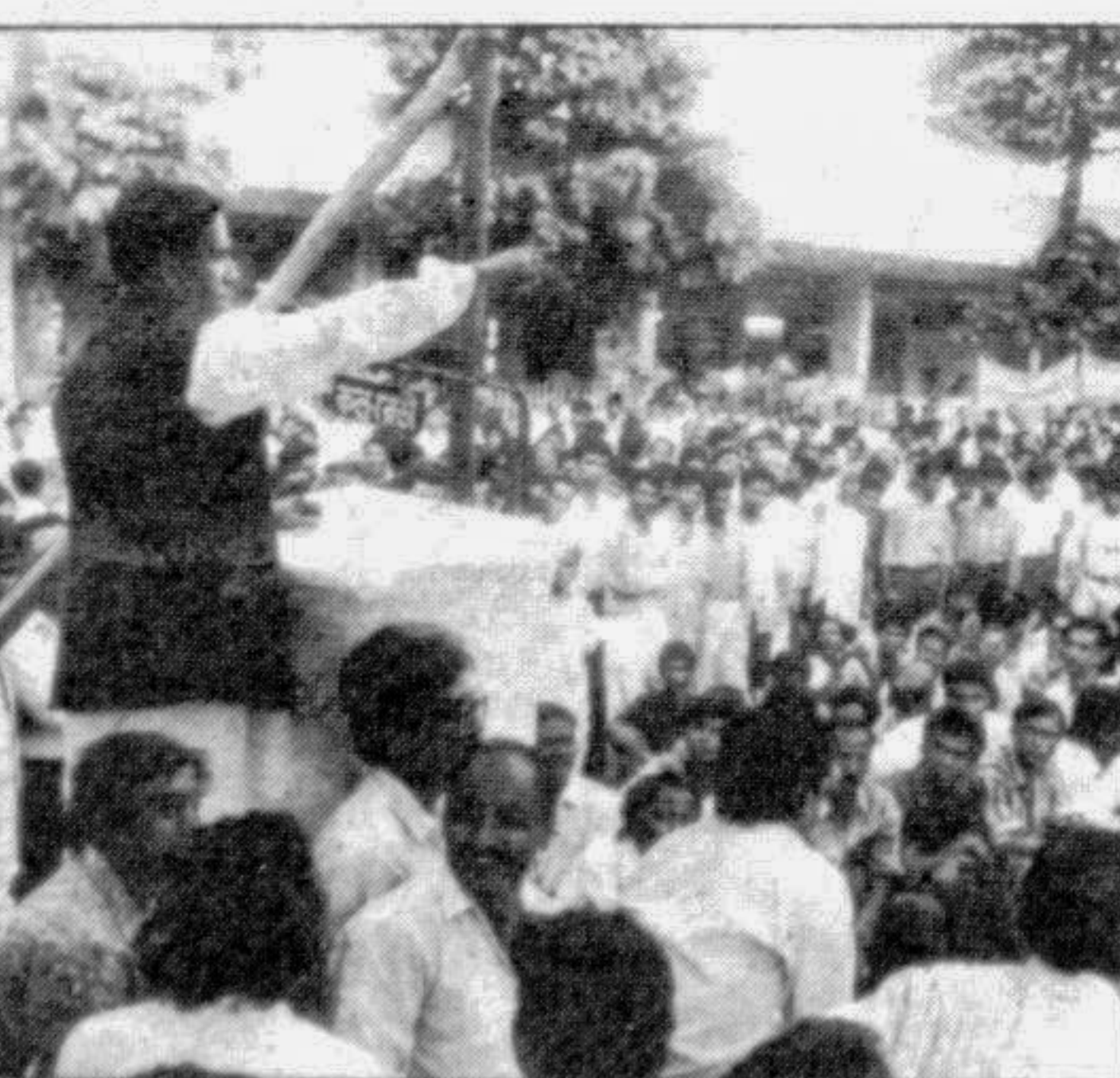
Abdur Razzak MP addressing a rally of the Nir-mul Samannya Committee in the city's Gulistan area yesterday.