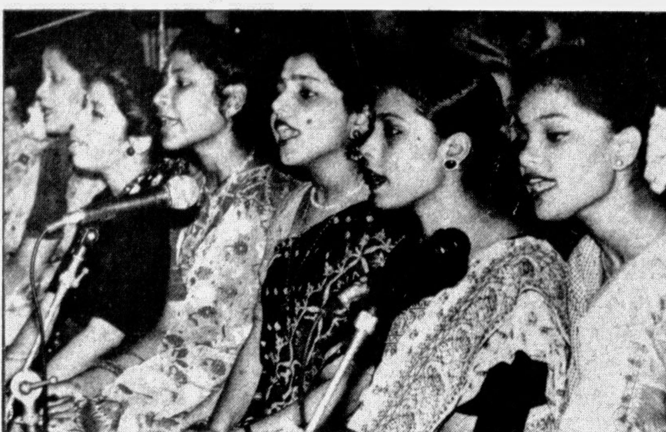
The artistes of the Nazrul Academy presenting songs at the Institution of Engineers' auditorium in the city yesterday marking the 30th founding anniversary of the academy.